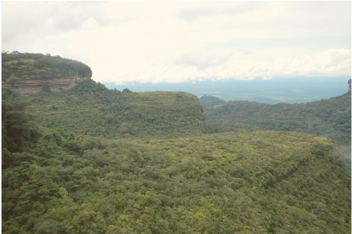
Fig. 4. Submontane forest and shrubland vegetation at 850 m altitude in the Kounounkan Massif. Both vegetation types are dominated by species that are not resistant to fire. The shrubland vegetation blends gradually into the surrounding submontane forest.