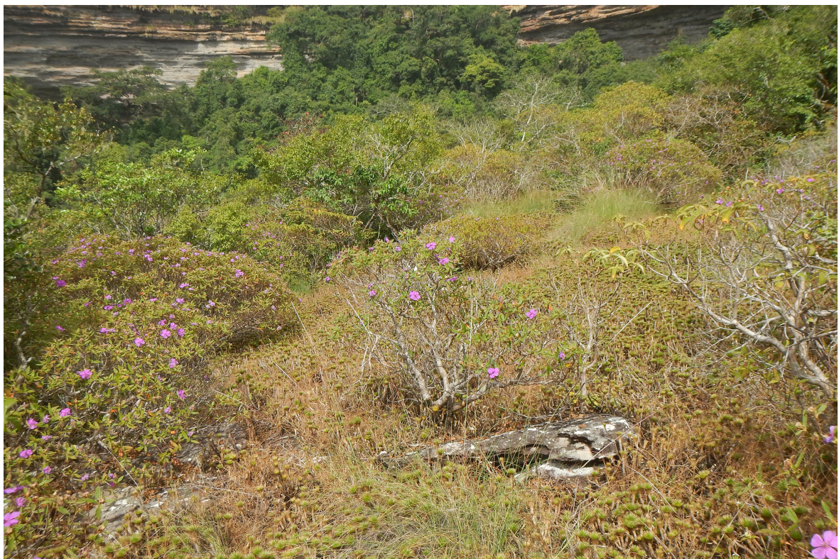
Fig. 5. Inside the submontane shrubland vegetation of Fig. 4. Gladiolus mariae occurs abundantly in this vegetation type. The vegetation is dominated by shrubs that are not resistant to fire: Cailliella praerupticola (in flower), Dissotis leonensis (both Melastomataceae ) and Microdracoides squamosa ( Cyperaceae ). Grasses ( Poaceae ) are infrequent; the only grass visible is Rhytachne perfecta , front and centre right. – Photograph taken on 27 Nov 2017 by Xander van der Burgt.