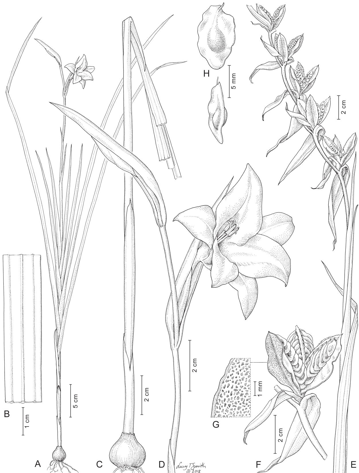
Fig. 2. Gladiolus mariae – A: flowering plant; B: detail of leaf; C: base of plant showing corm and 3 cataphylls; D: upper part of plant with an open flower and a flower bud; E: upper part of fruiting plant with 5 mature fruits; F: mature, open fruit with seeds; G: detail of dotted epidermis of fruit; H: seeds. – Origin: A–D from Burgt & Haba 2012 (type gathering); E–H from Burgt 2161. – Drawing by Lucy T. Smith.