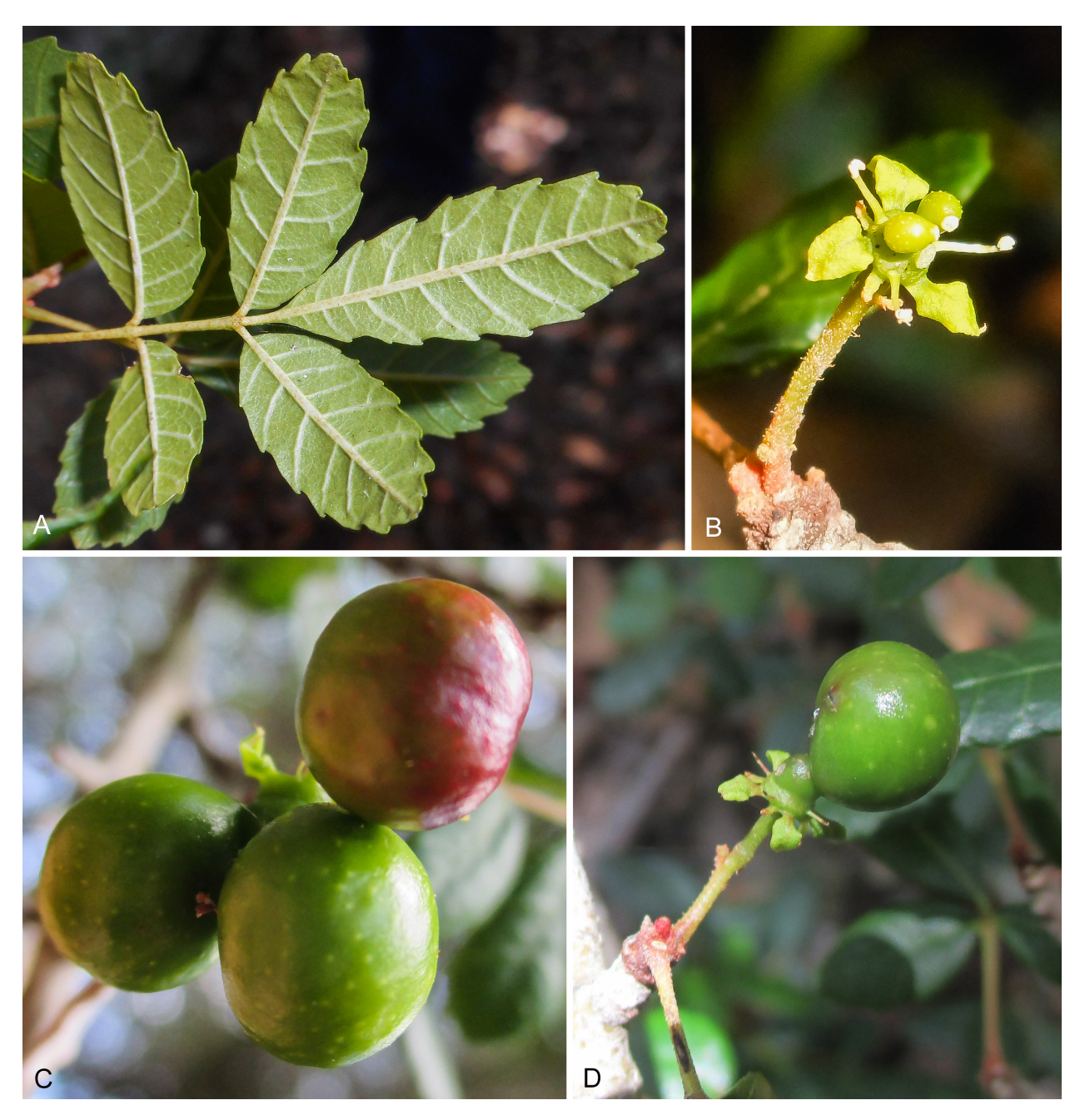
Fig. 2. Picrasma pauciflora – A: leaf showing number of leaflets and their abaxial surface; B: bisexual flower with tiny, immature fruits; C: drupaceous mericarps; D: drupaceous mericarp in lateral view, showing gynophore developed from intrastaminal disk. – All photographs taken at: Cuba, Holguín, Rafael Freyre, Loma El Templo, 23 May 2017; A, B: by José Luis Gómez-Hechavarría; C, D: by Pedro A. González-Gutiérrez.