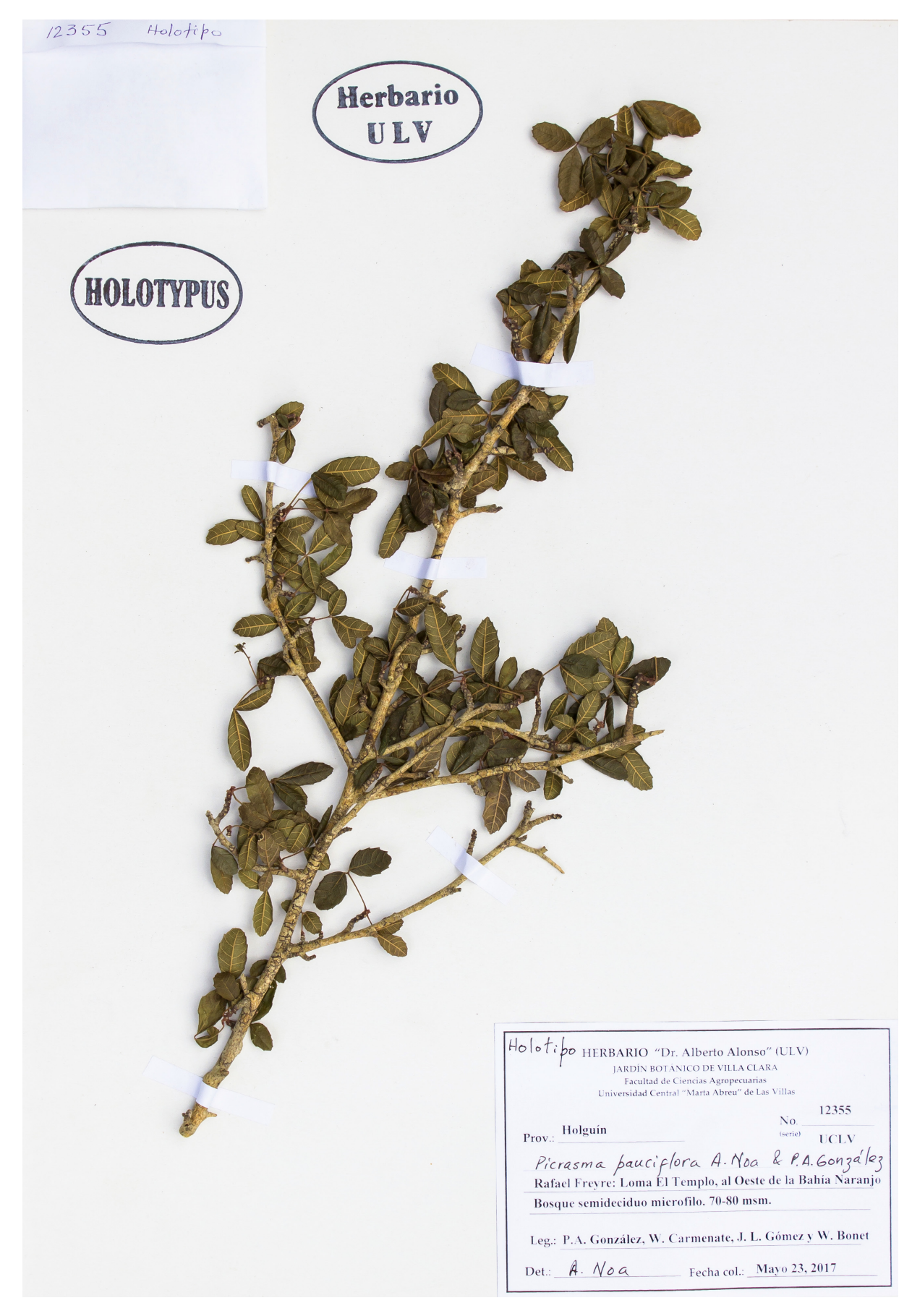
Fig. 1. Holotype of Picrasma pauciflora , González & al. , UCLV#12355 (ULV).