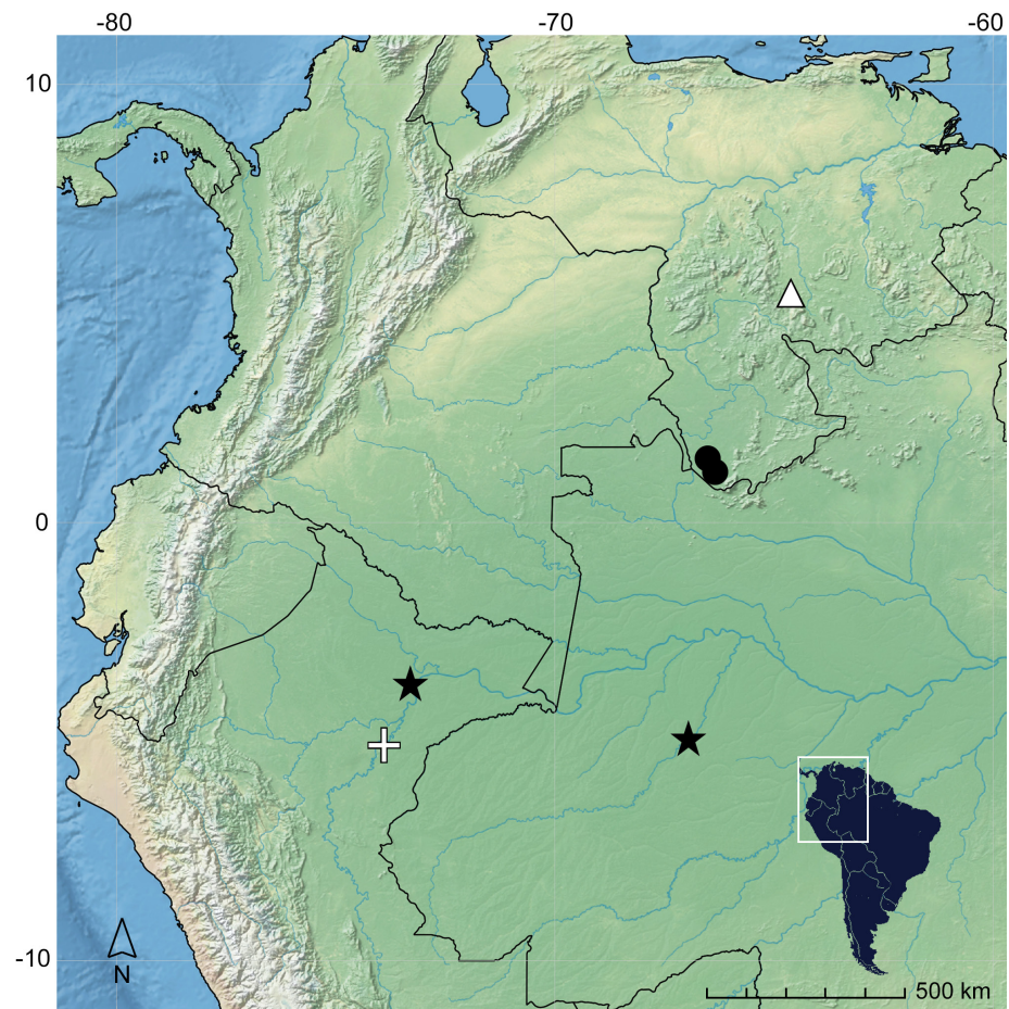
Fig. 1. Distribution of Tovomita caudata (black stars), T. grandis (white cross), T. nervosa (black circles) and T. nidiae (white triangle).

Diagnosis — Tovomita caudata is similar to T. amazonica (Poepp.) Walp. by the small leaves, ovoid floral buds and number of stamens (c. 23). The species can be distinguished from T. amazonica by the subcoriaceous (vs chartaceous) leaf blades with a long-acuminate apex (0.6–1.2 cm vs up to 0.8 cm long on large leaves) and