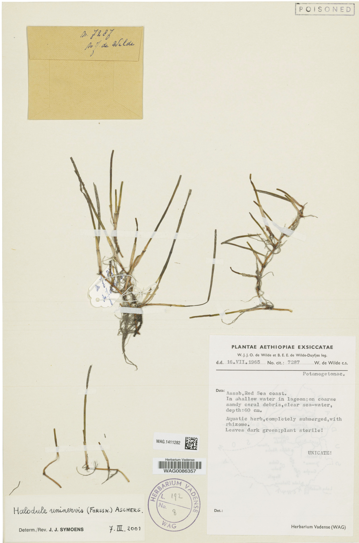
Fig. 6. Neotype of Zostera uninervis ( \equiv Halodule uninervis ) in WAG (barcode WAG0086357 and 2-D code WAG.1411282).