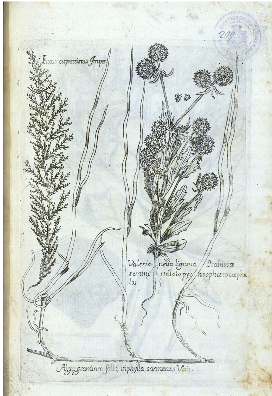
Fig. 1. Lectotype of Zostera nodosa (= Cymodocea nodosa), the illustration “Alga gramineo folio, triphylla, sarmentis Vitis” in Cupani, Panphyt. Sicil. 2: t. 191. 1713.