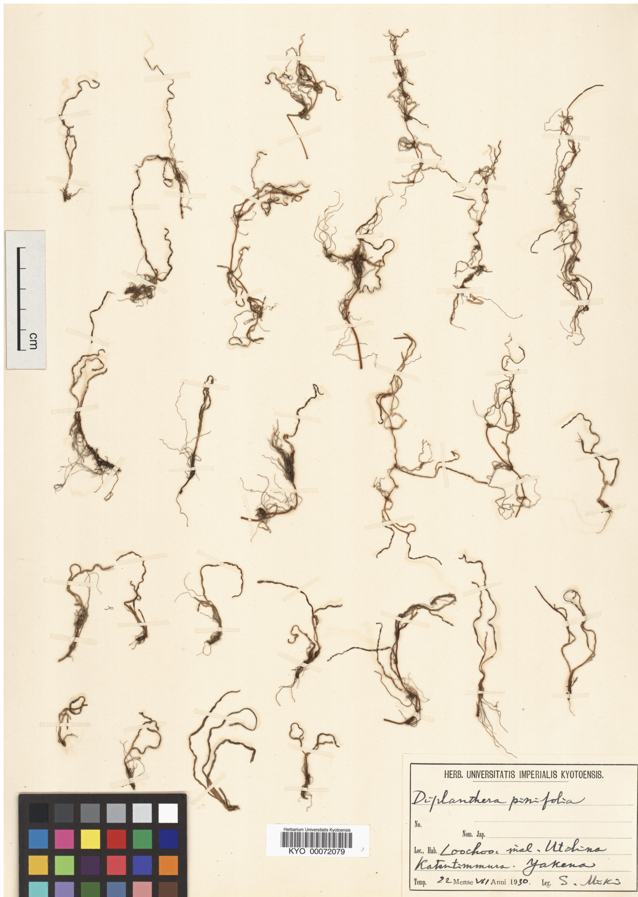
Fig. 5. Lectotype of Diplanthera pinifolia ( \equiv Halodule pinifolia ) in KYO (barcode KYO 00072079).