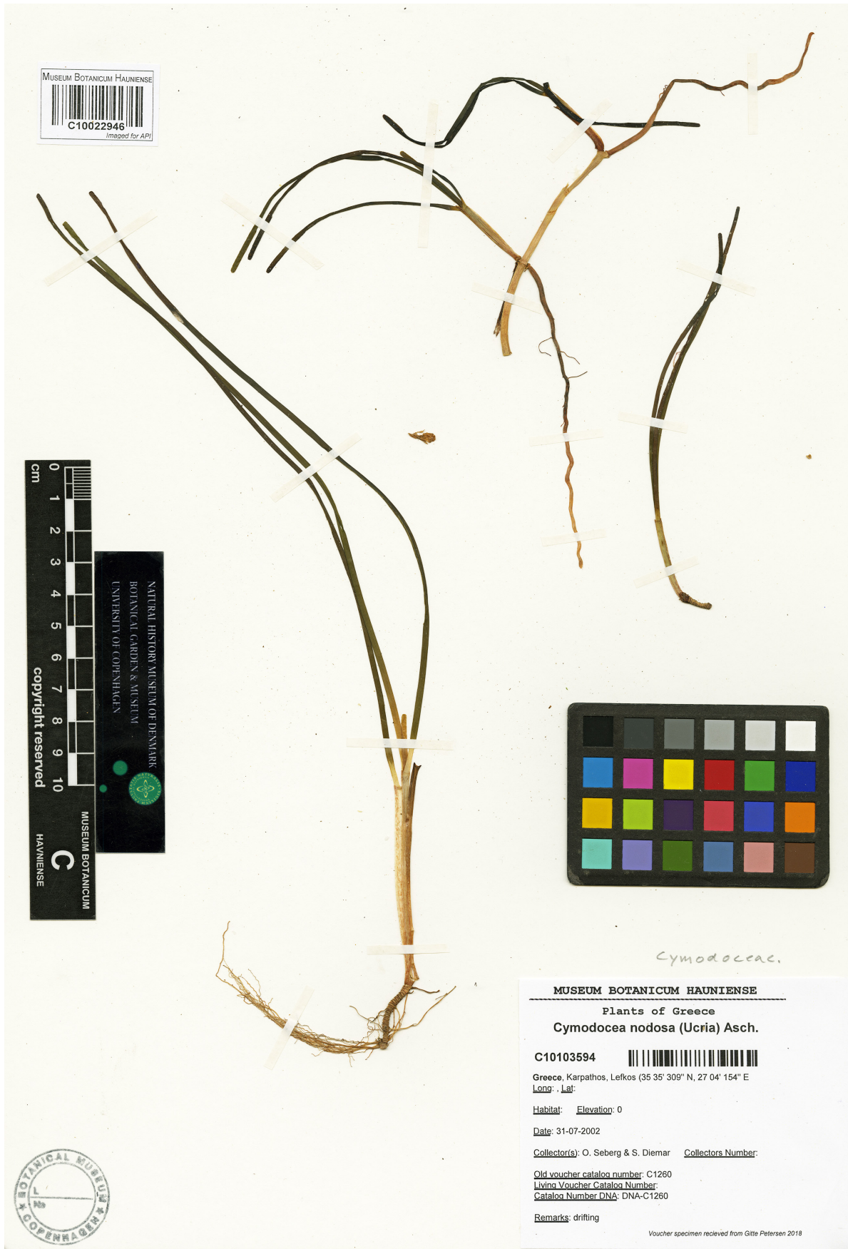
Fig. 2. Epitype of Zostera nodosa ( \equiv Cymodocea nodosa ) in C (barcode C10103594).