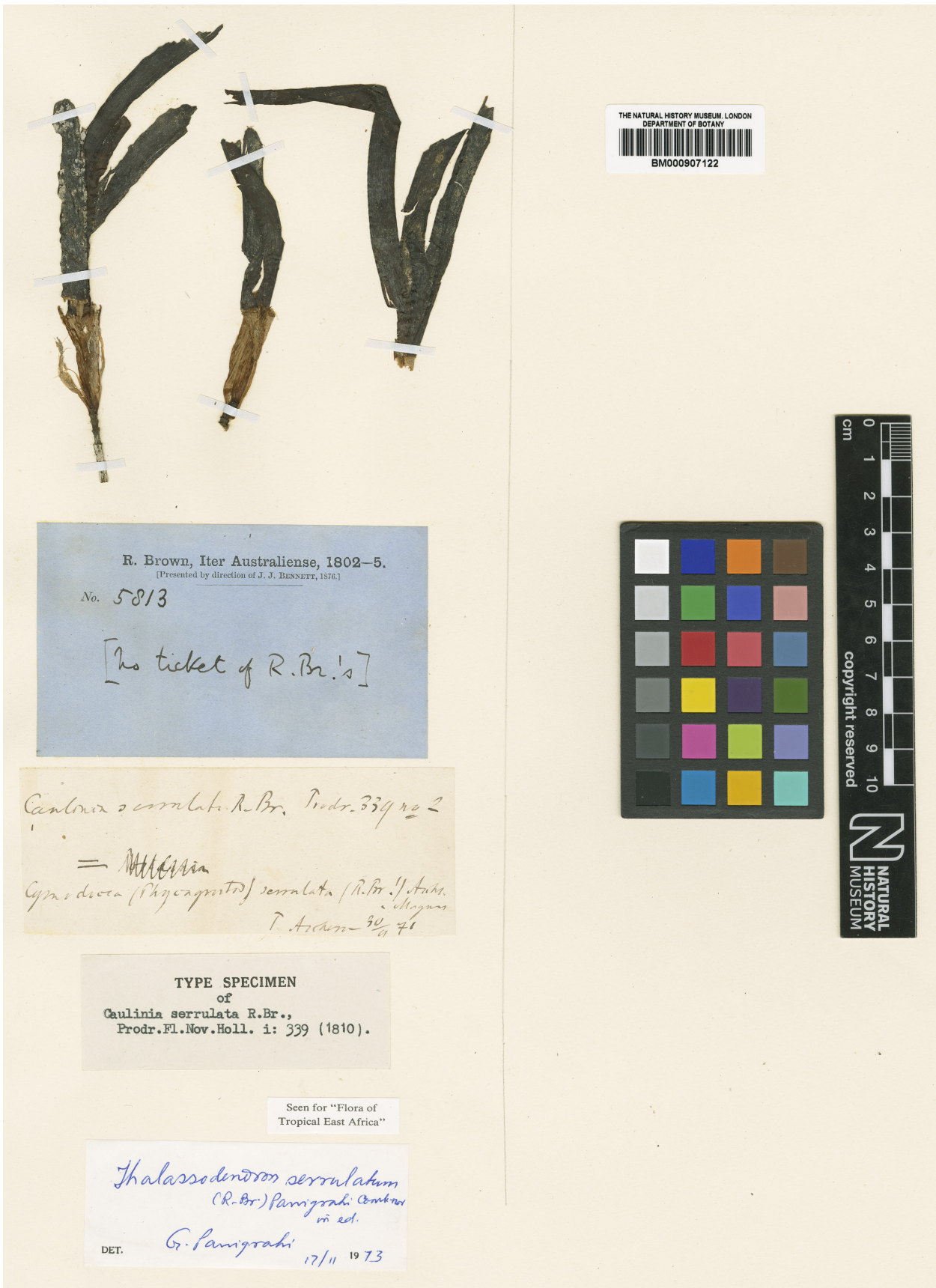
Fig. 3. Lectotype of Caulinia serrulata ( \equiv Cymodocea serrulata) in BM (barcode BM000907122).