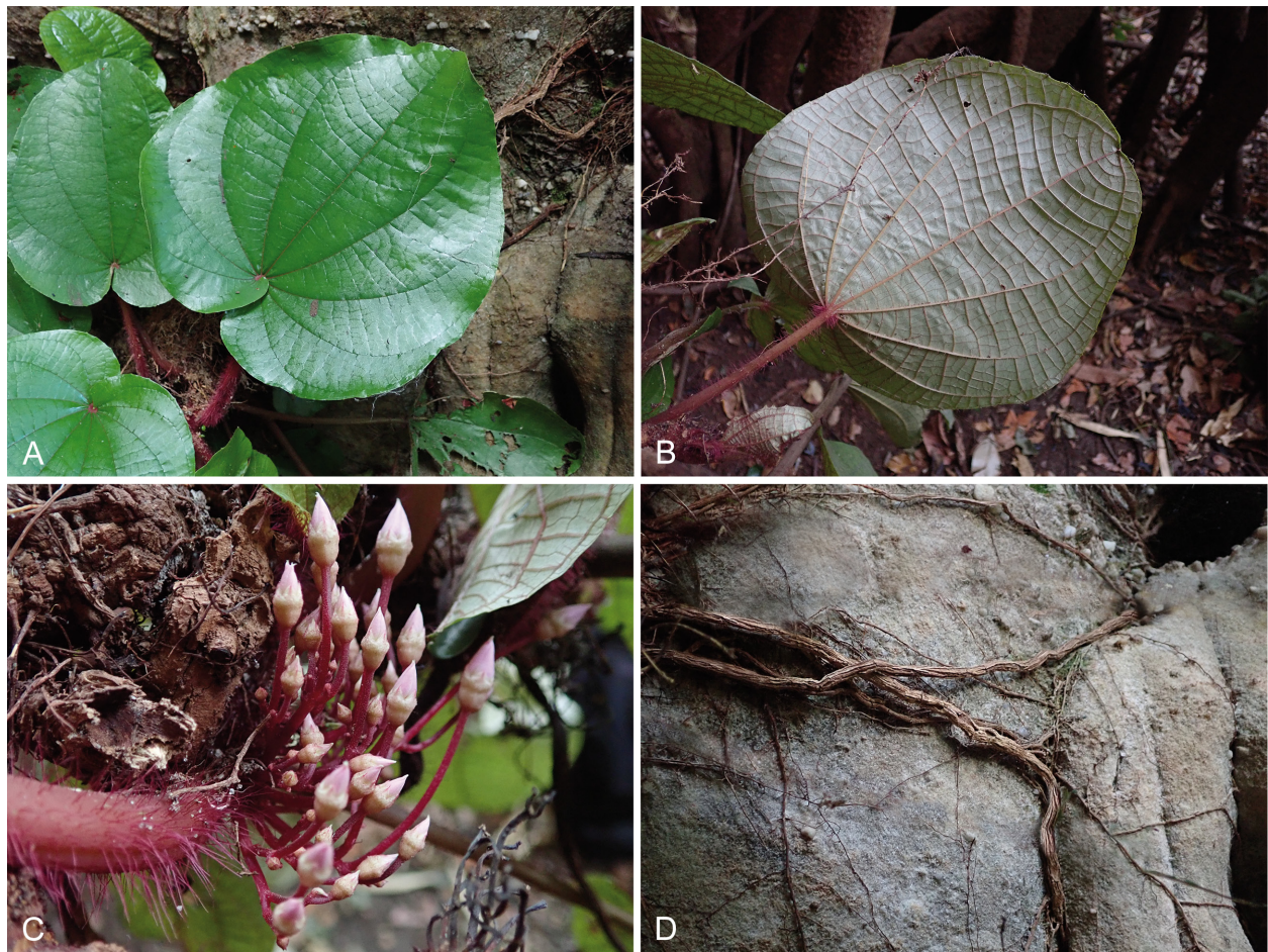
Fig. 4. Benna alternifolia – A: leaf upper surface; B: leaf lower surface; C: inflorescence with flower buds; D: roots. – Origin: A, D from Burgt & Haba 2333; B, C from Burgt & al. 2274 (type gathering).

collections from the Benna Plateau, Burgt & al. 2274, 2323 and Burgt & Haba 2333, represent a new, monotypic genus. The genus is named Benna Burgt & Ver.-Lib. and the species is named Benna alternifolia Burgt & Ver.-Lib. in the taxonomy section of the present manuscript.