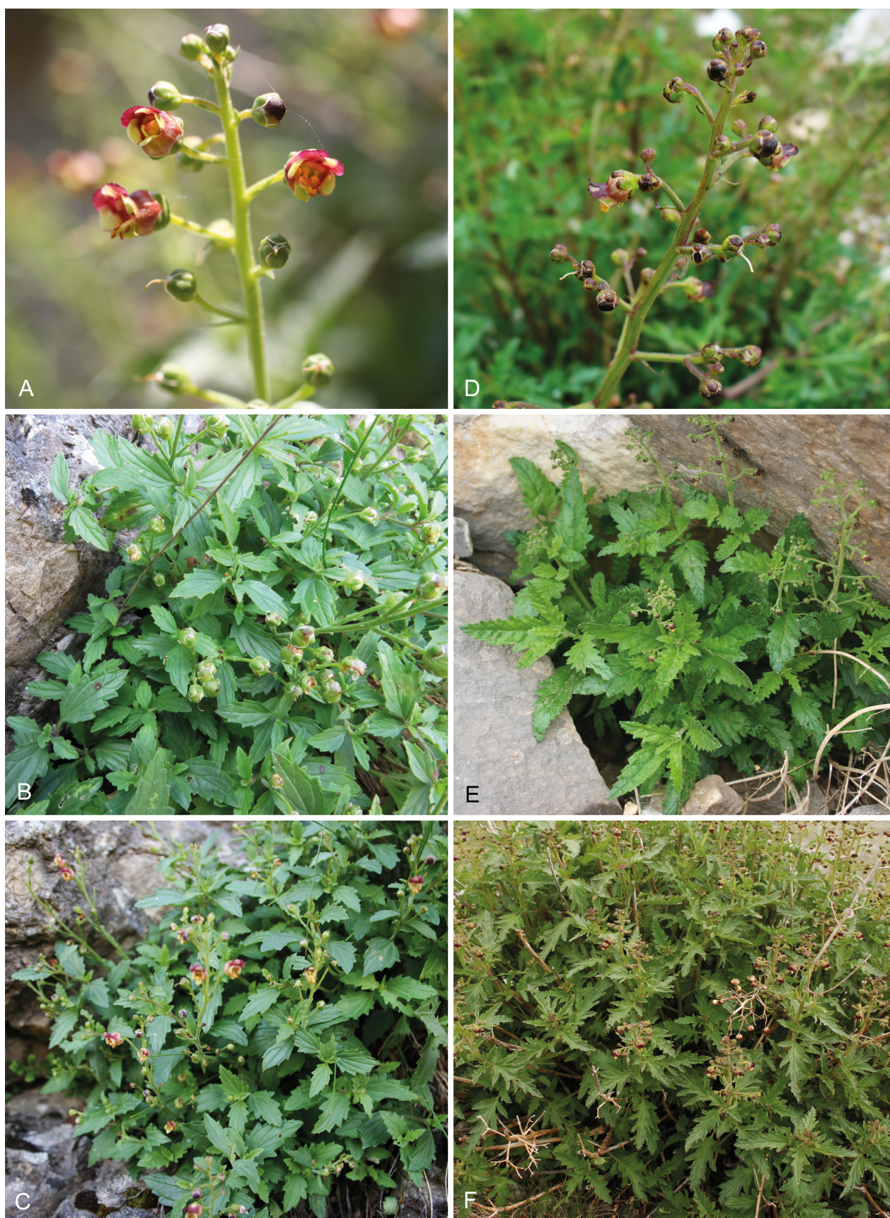
Fig. 1. Comparison of Scrophularia bulgarica (A: inflorescence; B, C: stems and leaves) and S. heterophylla subsp. laciniata (D: inflorescence; E, F: stems and leaves). – Photographs by S. Stoyanov and Y. Marinov.