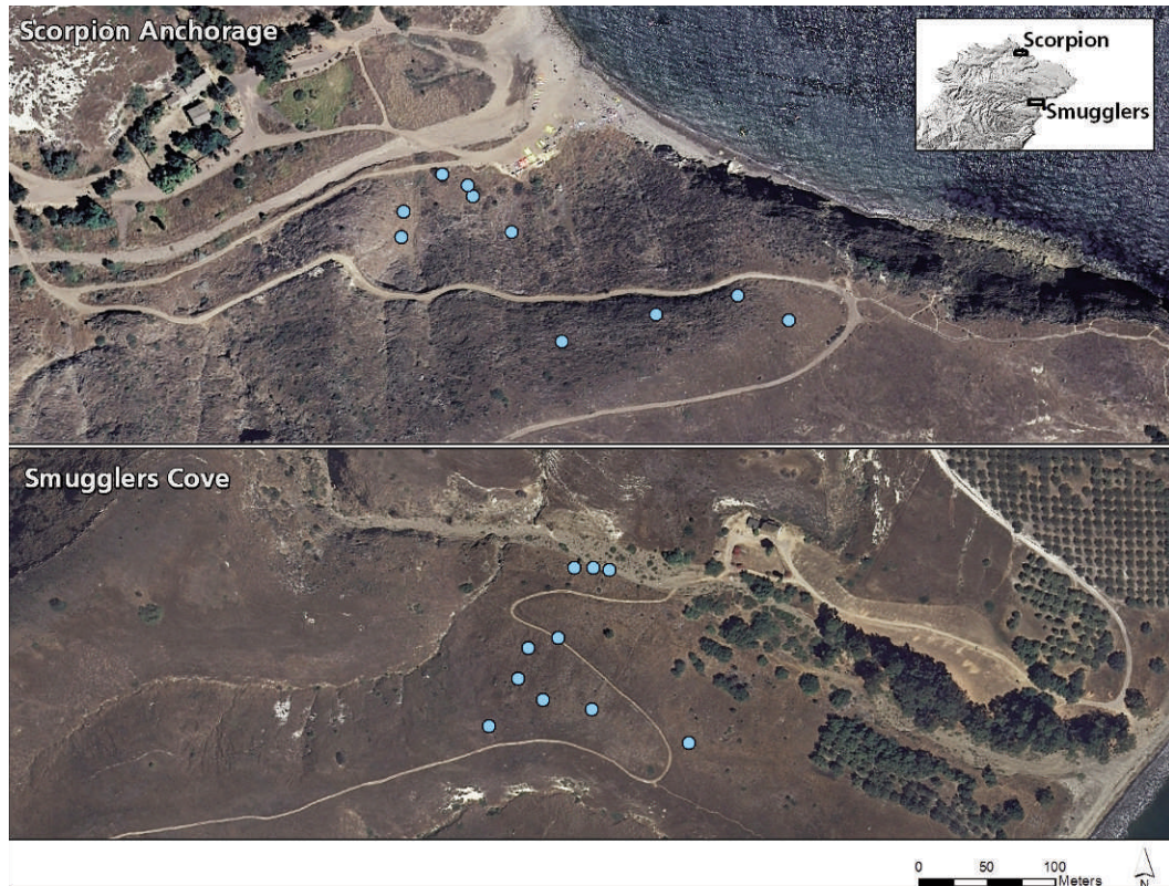
Fig. 1. Study areas in Scorpion Anchorage and Smugglers Cove, Santa Cruz Island, California. Dots indicate locations of fennel plot pairs. Inset shows location of sites on east Santa Cruz Island.

communities across much of the island (Cohen et al. 2009).