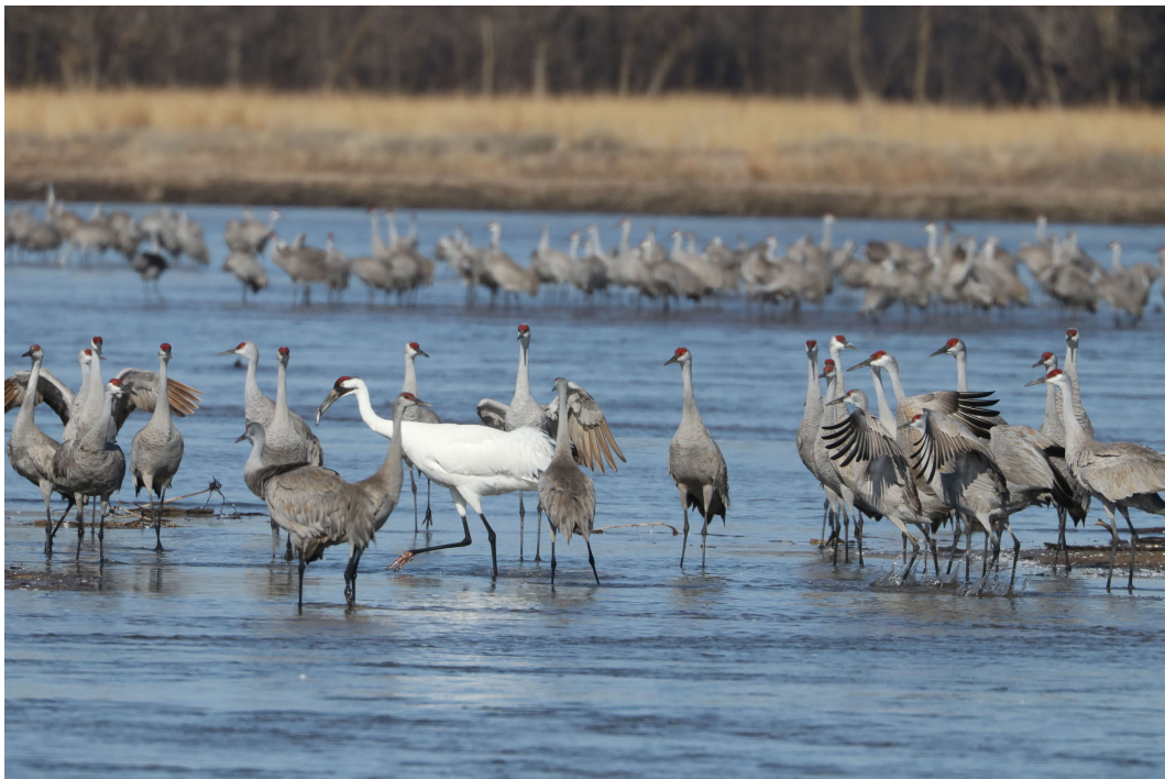
Fig. 1. Photo of an adult Whooping Crane ( Grus americana ), with a channel catfish ( Ictalurus punctatus ; estimated at just over one year old) in its bill, moving among Sandhill Cranes ( Antigone canadensis ) on 22 March 2018 at about 10:30 on the main channel of the Platte River, Hall County, Nebraska, USA.

add to the sparse information concerning Whooping Crane diet during migration by describing an observation novel to the scientific literature regarding an adult feeding on multiple juvenile channel catfish ( Ictalurus punctatus ) in the CPRV.