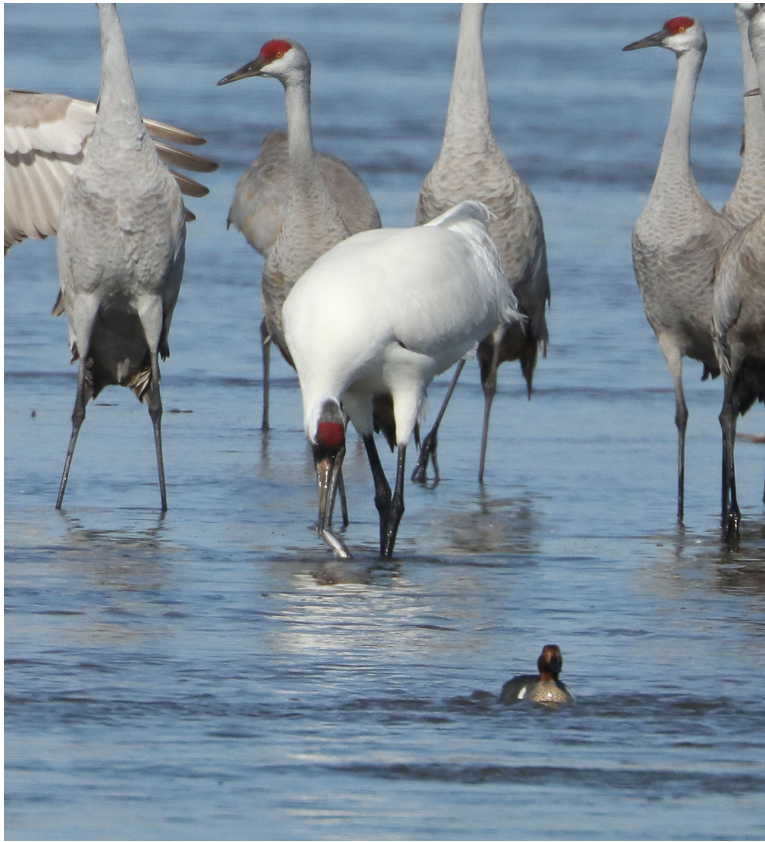
Fig. 2. Whooping Crane ( Grus americana ), capturing a channel catfish ( Ictalurus punctatus ; estimated at just over one year old) in its bill, surrounded by onlooking Sandhill Cranes ( Antigone canadensis ) on 22 March 2018 at about 10:45 on the main channel of the Platte River, Hall County, Nebraska, USA.

agonistic behavior with Sandhill Cranes (see Ellis et al. 1998 for a description of agonistic behaviors). We identified all 5 fish consumed as juvenile channel catfish from a series of 19 photos taken by 2 photographers noting the following features: the presence of a forked caudal fin, the presence of an adipose fin, a lack of scales, the body-depth-to-length ratio, and the placement of pectoral fins (Page and Burr 2011; Fig. 2). We approximated the length of the channel catfish by using the average exposed culmen length (upper bill, 13.8 cm) of adult Whooping Cranes (culmen length: female mean = 13.7 cm [ n = 7 ], male mean = 13.9 cm [ n = 15 ]; Johnsgard 1983). We estimated that the channel catfish ranged from 70% to 85% of the crane's exposed culmen length, resulting in estimated total body lengths ranging from 97 mm to 117 mm. Holland et al. (1992) found that 1-year-old channel catfish (at annulus for-