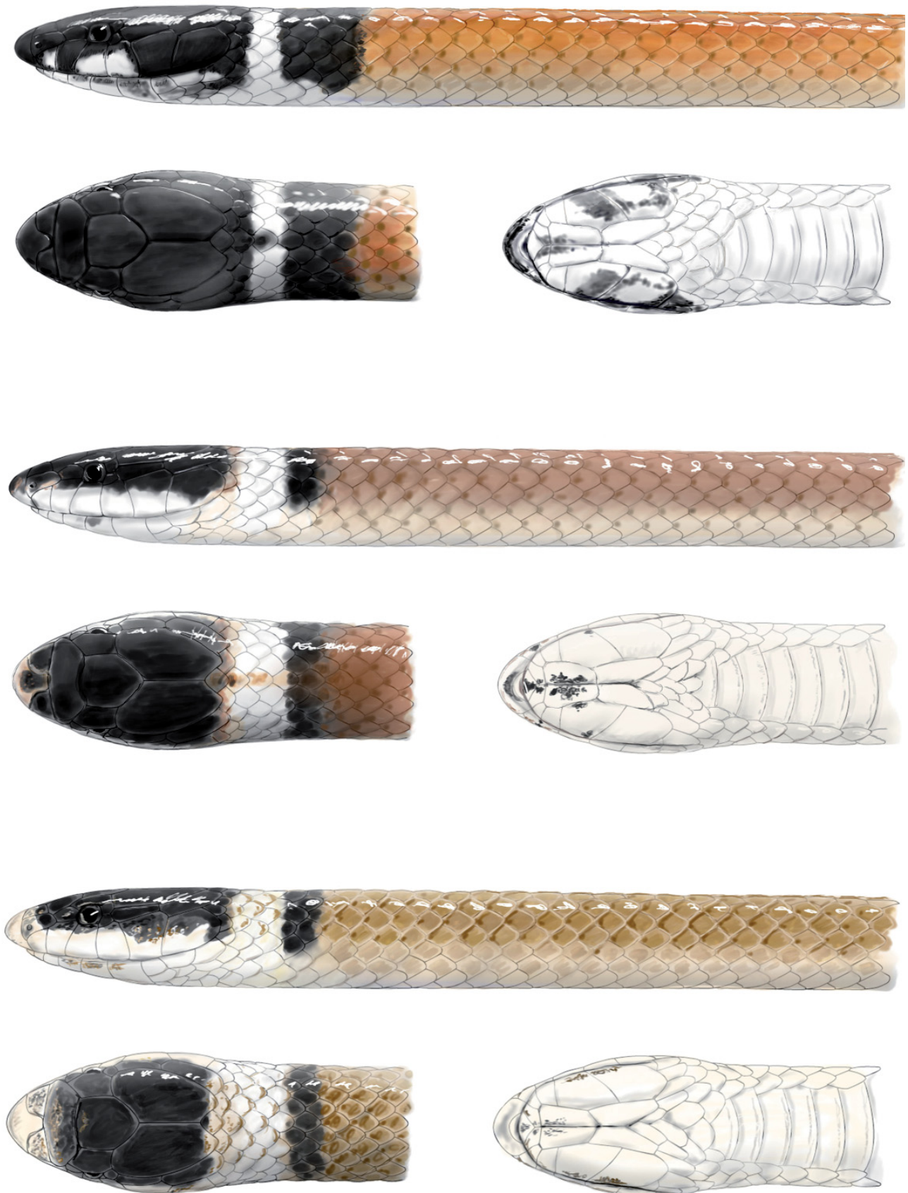
Fig. 2. Morphological variation of Phalotris concolor . Top: Juvenile male (CHUNB 51553, former holotype of P. cerradensis ); Middle: Adult male (MZUFV 1890); Bottom: Adult female (MZUFV 1870).