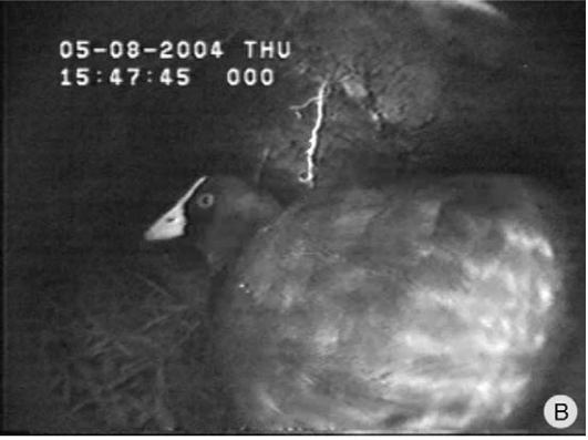
Figure 2. Still images captured from video showing (A) a House Mouse attempting to eat an unattended Atlantic Petrel egg, and (B) a Gough Moorhen inside the same burrow, a few hours later (note date and time data on top left hand corner of images) eating the egg.

2005, Angel & Cooper 2006). Gough Moorhens both prey on House Mice and scavenge their carcasses, placing them at significant risk of secondary poisoning (from eating poisoned mice) in the event of a toxic bait operation. Therefore any eradication operation on Gough Island that broadcasts rodenticide should include a plan to mitigate the effects or safeguard the Gough Moorhen population from secondary poisoning, e.g. taking a captive population. Fortunately for Gough Moorhen conservation, their introduction on Tristan da Cunha established another population. In the (unlikely) event of incidental elimination of the