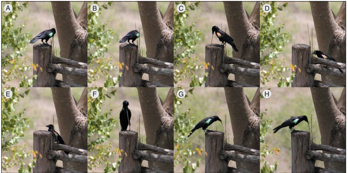
Figure 1. A wild New Caledonian Crow (ID-code is 'HC3'; 6 November 2007) using two dry grass stems as tools for foraging on a wooden fencepost. 12:15:48 – First photo of crow taken on the fencepost; the bird has no tool in its beak. 12:15:53 – HC3 moves to another part of the fence; still no tool. 12:16:09 – HC3 moves to the top of one fencepost with a grass-stem tool (tool A) and proceeds to probe with this tool for c. 5 seconds (A to C) before placing it on the surface of the post (from where it falls to the ground; tool A could not be recovered as it had fallen amongst other pieces of dry grass); HC3 appears to look down into the crevice. 12:16:23 – HC3 has moved from the fencepost to an adjacent (c. 30 cm) horizontal fence section (D), where it is within reach of a large bundle of dry grass stems. 12:16:31 – HC3 manufactures tool B by breaking off a long section of a dry grass stem and shortening it (the missing section can be identified by comparing (D) and (E)). 12:16:33 – HC3 returns to the top of the fencepost and resumes probing into the crevice with tool B (E). 12:16:39 – HC3 looks down into the crevice, with tool B still inserted; it then resumes probing with tool B (F). 12:16:43 – HC3 leaves tool B in the crevice and picks up the first lizard with its beak (G), holding it in the beak for c. 30 seconds before swallowing it head-first. 12:17:28 – HC3 resumes probing into the crevice with tool B. 12:17:45 – HC3 catches a second lizard, and draws the lizard and tool B together out of the crevice (H). 12:17:54 – HC3 places tool B (which is now shorter and without node; see Fig. 2) and the second lizard on the surface of the post and disentangles them by using its left foot to secure the tool and its beak to restrain the lizard. 12:17:58 – HC3 swallows the second lizard head-first and flies off, leaving tool B on the post (tool later recovered; see Fig. 2).

minutes, during which time 45 photos were taken. Such sustained, close-up observation of tool use by wild crows is rare, without the use of either a hide at a baited site, or remote telemetry (see Rutz et al. 2007). The bird, an adult male, had been trapped on 15 December 2006, when it was marked with wingtags, rings and a tail-mounted video-tag; the latter was shed prior to the present observation.