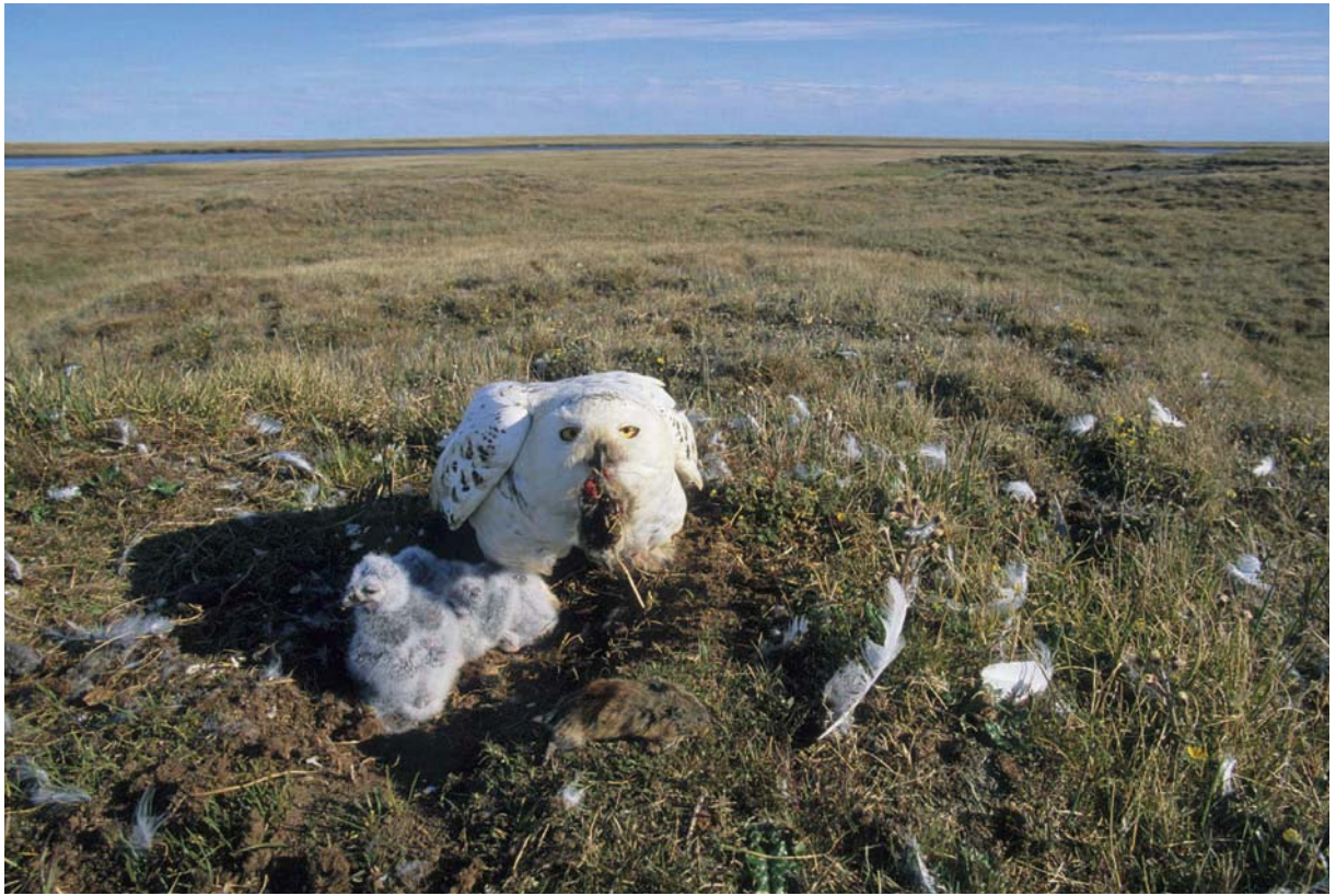
Figure 1. Snowy Owl feeding young at nest, showing use of polygon/mound landscape, Barrow, Alaska.