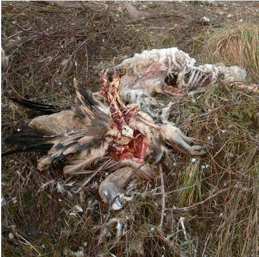
Figure 1. Leftovers of the carcasses of a Griffon Vulture and a sheep eaten by vultures. The rock on the left trapped the vulture's wing.

cate if the birds had been killed by conspecifics or not. Margalida et al. (2004) recorded cannibalism in a Bearded Vulture Gypaetus barbatus nest. Kornan & Nacek (2011) recorded parental infanticide followed by cannibalism in Golden Eagles Aquila chrysaetos . Cannibalism linked with natural deaths of nestlings has also been documented in other raptor species, among others American Kestrel Falco sparverius (Bortolotti et al. 1991), Booted Eagle Aquila pennata (Dios 2003) and Bald Eagle Haliaeetus leucocephalus (Markham & Watts 2007).