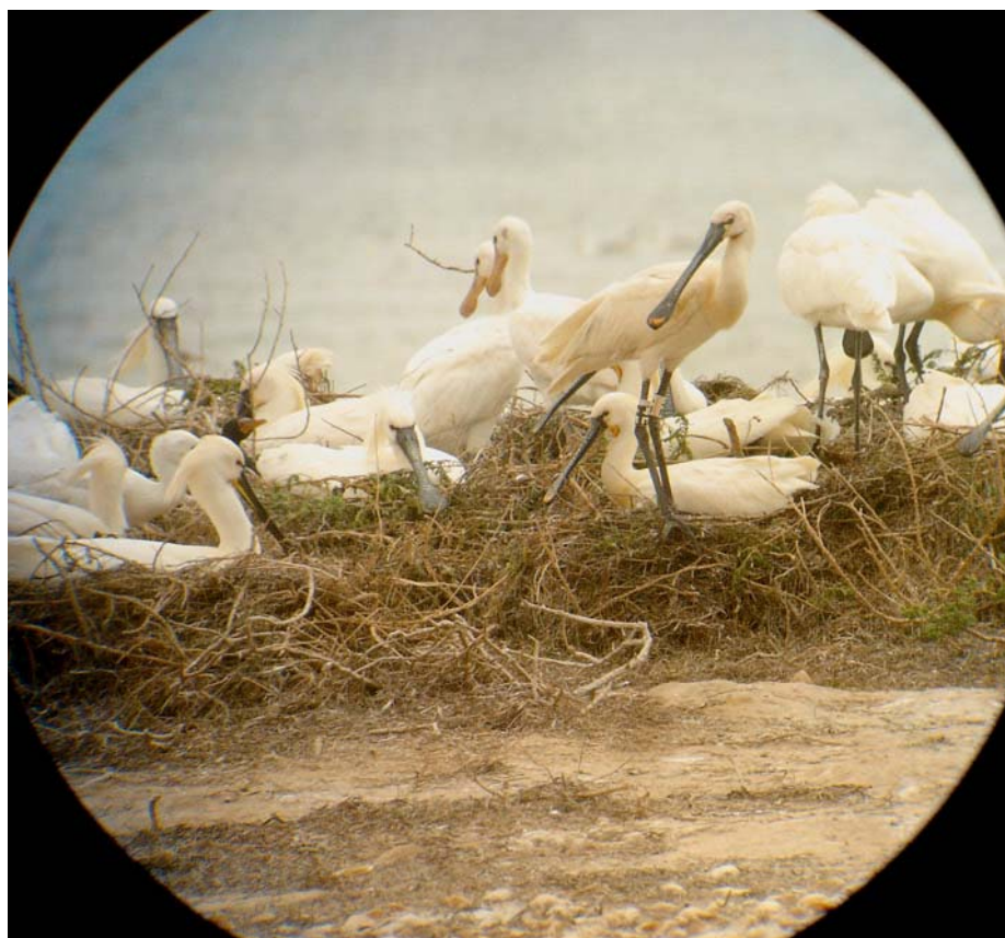
Figure 3. A colour-ringed bird born on Terschelling in 1997 standing on its nest on Nair (Banc d'Arguin) on 17 May 2010. A month later it was observed feeding chicks. Its partner (sitting on the nest) has a yellow bill tip. Given that male spoonbills generally have larger bills than females, the standing bird is probably a male.

studies on avian subspecies. A sample of studies on migrant bird species, although generally using slightly smaller sets of microsatellite loci, showed rather comparable levels of differentiation; in order of increasing F_{ST} : Dunlin Calidris alpina (three subspecies, 7 loci, F_{ST} \leq 0.010 ; Marthinsen et al. 2007), Canada Goose Branta canadensis (two subspecies, 6 loci, F_{ST} = 0.021 ; Mylecraine et al. 2008), Bluethroat Luscinia svecica (seven subspecies, 7–11 loci, F_{ST} = 0.042 ; Johnsen et al. 2006), Reed Bunting Emberiza schoeniclus (two subspecies, 6 loci, F_{ST} = 0.043 ; Kvist et al. 2011), and Piping Plover Charadrius melodus (two subspecies, 8 loci, F_{ST} = 0.104 ; Miller et al. 2010). Thus, with F_{ST} = 0.063 , the observed genetic differentiation between the two Spoonbill subspecies seems to fall in the upper range of values. On the basis of this comparison the subspecies status of balsaci seems entirely valid.