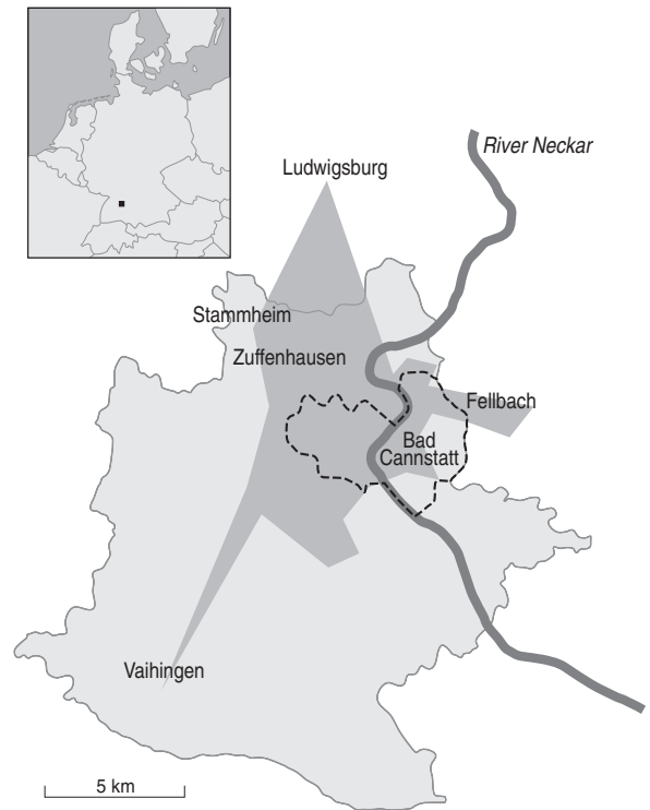
Figure 1. The feeding range of Amazon Parrots within the city of Stuttgart (indicated by the dark grey colour). The city is indicated by a light grey colour. The roost site is located in Bad Cannstatt, a part of Stuttgart indicated by the dotted line. The other district/town names indicate the extent of the known parrot distribution (sightings in those districts).

Since their introduction in 1984 and their first successful brood in 1986, a population of Yellow-headed Amazon Parrots has established itself in Stuttgart (Bauer & Woog 2008) and has grown to a maximum of 46 individuals in winter 2011/2012. In addition, some Blue-fronted Amazon Parrots and their hybrid offspring occur in the area. The population of parrots grows slowly, presumably because the Amazon Parrots start breeding only in their 5th year (Hoppe 1981) and have few young with low survival rates. Mortality in the urban population may occur through road accidents, collisions with electricity cables and windows, getting trapped in chimneys, being illegally shot, or due to cold temperatures in winter (T. Mika, K. Schwarz & C. König, pers. comm.). The Amazon Parrots forage in a large part of the city, specifically in parks, the zoo, various cemeteries and domestic backyards (Figure 1, Hoppe 1999). These areas are rich in native and non-native trees and shrubs from all over the world. Plants were identified using the park tree register and with the help of the botany department at the State Museum of Natural history in Stuttgart. At dusk, birds gather at roosting trees, mainly London Plane Platanus x acerifolia in the district of Bad Cannstatt (N48° 48' 12.7" E9° 13' 5.5", 207m above sea level), close to street lights and heavy traffic. In summer, this roosting site was only used by non-breeders if at all.