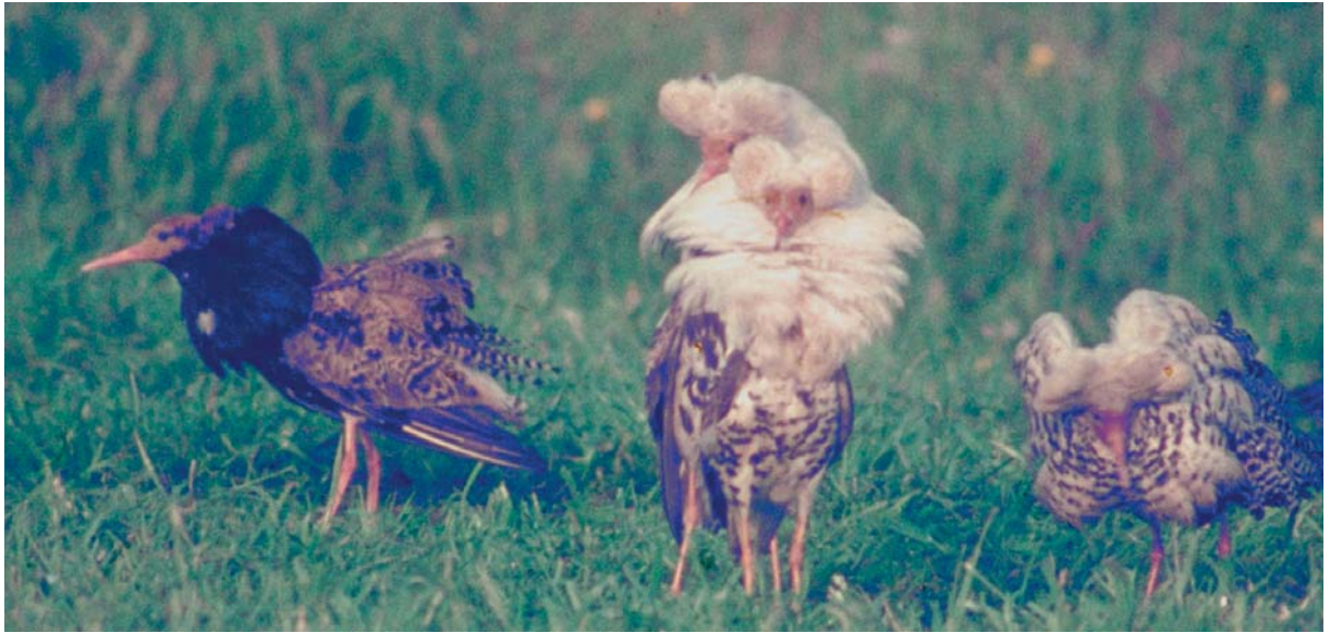
Figure 1. Two territorial independent males (left and right) and two satellite males (middle) on a lek.

Warburg 1966, van Rhijn 1991, 2013, Jukema & Piersma 2006): independent males, satellite males and faeders (female mimics). These male types and strategies become apparent on leks where males display and females select a mating partner. It has been shown that each male follows only one of these strategies during its whole life and that the different reproductive strategies in Ruffs are based on different combinations of genes (Lank et al. 1995, 2013, Farrell et al. 2013). Independent males try to defend a territory on the lek and have mostly dark coloured nuptial plumage. Satellite males do not establish their own territory but instead, to gain access to females, temporarily associate with one of the independent males. Satellites have mostly white nuptial plumage (Figure 1). However, plumage coloration sometimes fails to predict reproductive strategy, as some types of plumages may occur both among independent and satellite males (Hogan-Warburg 1966, van Rhijn 1991). Faeders do not develop conspicuous ornamentation and look like females.