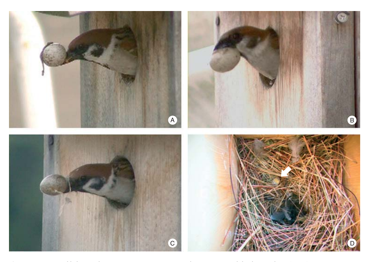
Figure 1. Egg removal behaviour by Eurasian Tree Sparrows at nest boxes A, B, C, and the destroyed egg (arrow) in nest D.

was laid in nest box A. One of the new breeders was A2; the other was a ringed female, identified by DNA-analysis. Hence, A2 is presumed to have been a male. The pair produced five eggs and raised one chick in the new breeding attempt.