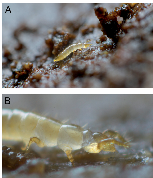
Fig. 3. Acerentomon specimen feeding on the ground of a beech ( Fagus sylvatica ) forest near East Pennard, UK. (A) Whole animal. (B) Detail of anterior part of body (legs and rostrum clearly visible).

The phenology of Protura has not been the focus of much research. The scarcity of records of juveniles, a phenomenon already pointed out by Walker & Rust (1975), makes it difficult to identify well defined phenological patterns useful for determining the life cycles of the majority of species. The first substantial data available in the literature were those about populations of Protura in soils supporting a mixed evergreen-deciduous forest in Tokyo (Imadatè, 1974). Imadatè documented different patterns of seasonal fluctuations in the collected species: a double-peaked pattern (maxima in spring and in autumn) in Eosentomon sakura , a single-peaked pattern (maximum in autumn) in E. kumei , Baculentulus morikawai , B. tosanus , Kenyentulus japonicus and Nippoentomon nippon , and an almost constant density all