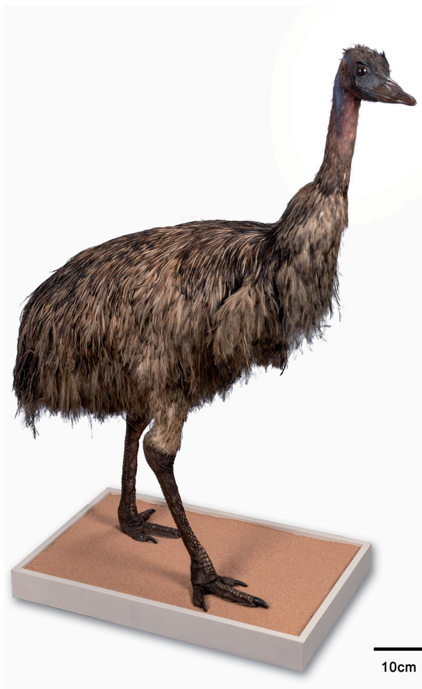
Fig. 1. The Geneva mounted specimen of Kangaroo Island Emu (MHNG-OIS-629.041).

The first goal of this study was to re-evaluate the phylogenetic placement of the specimen held in Geneva relative to all emus previously sequenced, sampled from Kangaroo Island, the other islands, and mainland Australia. To achieve this, we used High-Throughput Sequencing to reconstruct the complete mitochondrial genome for this specimen and compared it to all sequences available for emus. Our second objective was