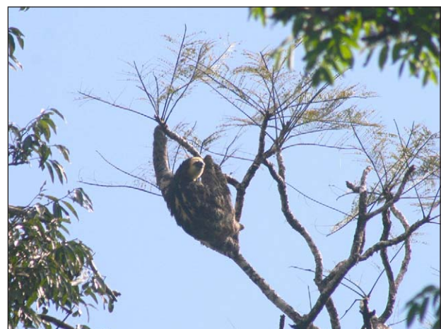
FIGURE 2. Male Bradypus tridactylus eating leaves of a Parkia velutina tree (Leguminosae: Mimosoideae) observed during boat surveys along the Araguari River on the border of the Floresta Nacional do Amapá (FLONA), state of Amapá, eastern Brazilian Amazon.