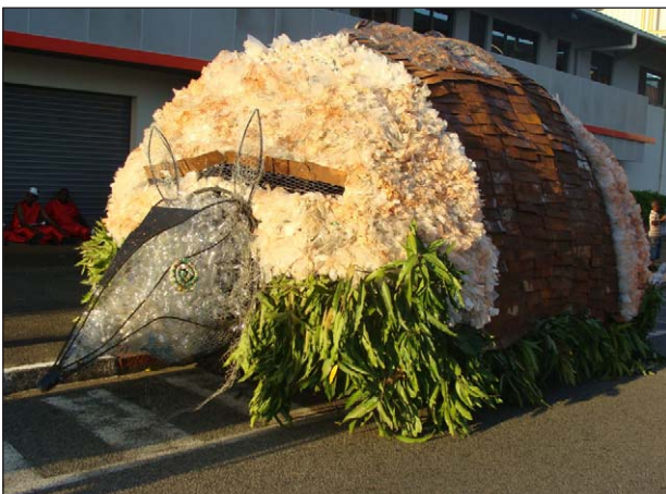
FIGURE 5. A representation of an armadillo at the main Carnival parade in Cayenne, February 2010. Photograph by Association Natural Tribal (Cayenne).

were caught alone with no other conspecific in the immediate vicinity;