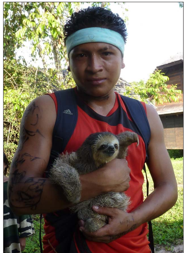
FIGURE 4. A young Bradypus tridactylus kept as a tamed pet by a Wayãpi Amerindian at Trois-Sauts. Photograph by François Catzefflis (November 2010).

Sloths, in their turn, benefit from a very positive value assigned to them in Wayãpi culture. If Bradypus tridactylus is the commonest game sloth in numbers, the two-toed sloths are even more appreciated. Both taxa are regularly kept as pets (FIG. 4),