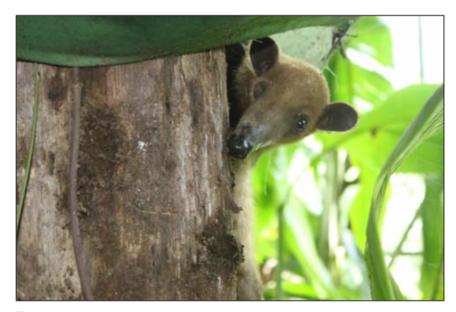
FIGURE 3. Fully recovered tamandua after approximately three months of rehabilitation, climbing one of the trees in the outside-enclosure in order to forage.

Following second surgery, the tamandua was given oral meloxicam (0.1 mg/kg) once daily for five days and 10 mg/kg amoxicillin (Andimox, 50 mg/ ml; Laboratorios Andifar, Tegucigalpa, Honduras) orally once daily for ten days. The tamandua took all medications voluntarily with coconut-water. No redness or discharge was present at the surgical site. After the procedure the eye remained slightly swollen for 12 days.