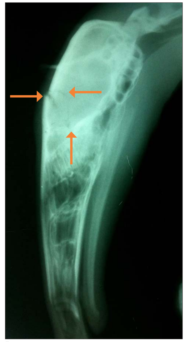
FIGURE 2. Radiograph with a laterolateral view on the tamandua's skull. A fracture of the frontal and parietal bone is visible (arrows).

obtunded. Warm water compresses were applied over the right eye for 10 min three times daily, and bandages were placed on all four paws over-night to prevent manipulation of the surgical wound. On day two meloxicam was not repeated due to dehydration and a concern for renal compromise. A 50 cm \times 70 cm \times 55 cm sized indoor enclosure provided the tamandua with soft bedding, warmth, and restricted movement. Thirty ml of a blend of mashed avocado, banana, puppy milk formula (Just Born Highly digestible Milk Replacer, Farnam Companies Inc., Phoenix, USA), coconut water, watermelon juice, papaya, and orange juice diluted in water were offered to the tamandua in a syringe every one to two hours. The rehabilitator massaged the tamandua's throat to encourage swallowing while feeding.