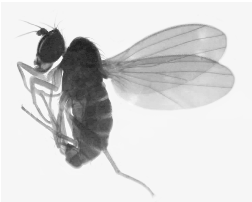
Fig. 1. Meuffelsia erasmusorum Grichanov, sp. n., general habitus of the holotype in alcohol before dissection.

Length less than 2.0 mm; body dark, with dark setae; dorsal part of postcranium slightly concave; face without setae, relatively broad, slightly narrowed downward; pedicel globular; postpedicel small, subtriangular; stylus dorsoapical; labella with 6 pseudotracheae; posterior part of mesonotum distinctly flattened and slightly depressed; acrostichals biserial; 6 dorsocentrals; scutellum with 2 strong bristles and 2 minute adjacent lateral hairs; fore and mid coxae with anterior and apical cilia; hind coxa with