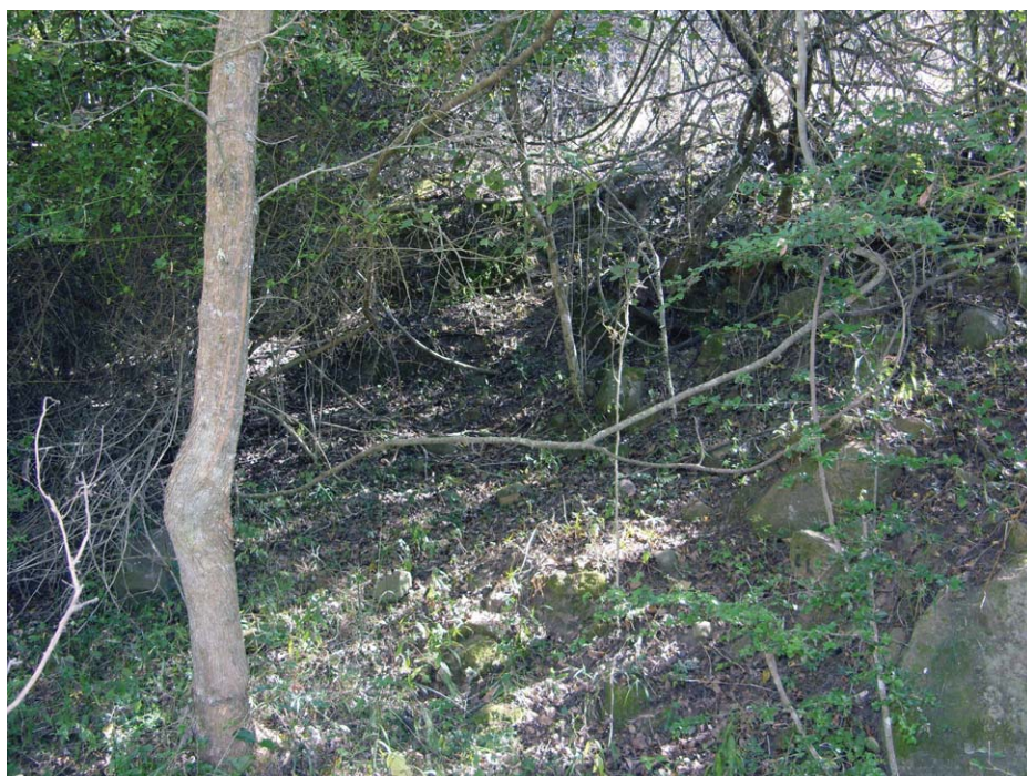
Fig. 7. Habitat at Sanyati Farm where the holotype and one of the paratypes of M. erasmusorum sp. n. were collected.

As reported by Dr R.M. Miller, the collecting site of the other two paratypes was most probably along the small river that runs down the valley with indigenous forest.