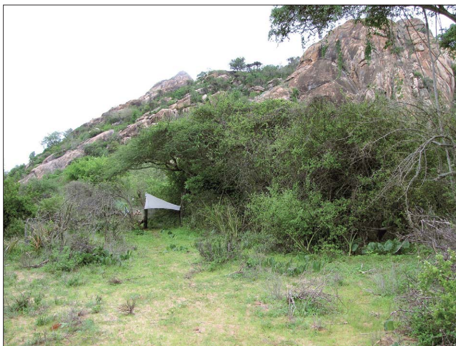
Fig. 11. The Malaise trap set at the foot of Ukasi Hill, where the type series of Hermannomyia ukasi sp. n. was collected.

Holotype: ♂ 'KENYA, Eastern Prov. / base of Ukasi Hill / 613 m. 0.82103°S. / 38.54443°E [0°49'S 38°33'E]', 'Malaise trap. Acacia / Commiphora savanna / 21 NOV-5 DEC 2011 / R. Copeland' (NMKE).