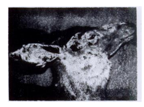
FIGURE 1. Severe alopecia of the muzzle, face, ears and skull areas. Note the keratin flakes in and on the ears.

Internal examination revealed a thin, emaciated carcass with severe depletion of fat depots and concomitant serous