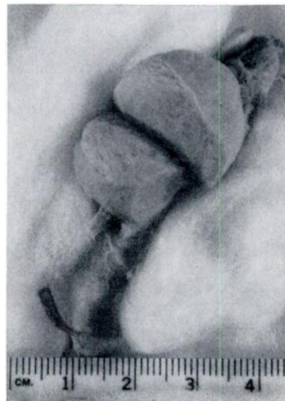
FIGURE 1. Testicular tumor from largemouth bass showing fibrous, swollen cut surface.

The cell morphology, banding and growth patterns, and staining characteristics of the lesion indicate a leiomyoma