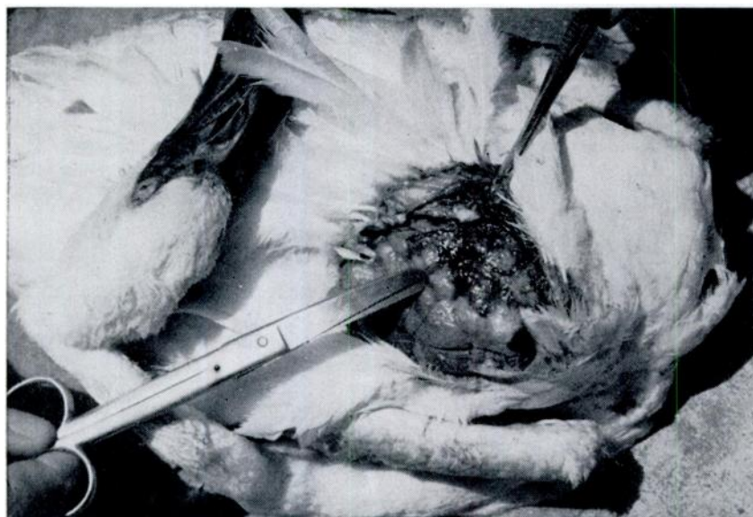
FIGURE 1. Flamingo 4, dorsal view, showing tuberculous lesion on shoulder region.