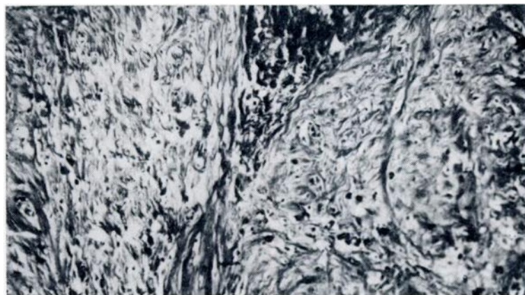
FIGURE 2. Masson's trichrome positive collagen ground substance. Masson's trichrome stain. X360