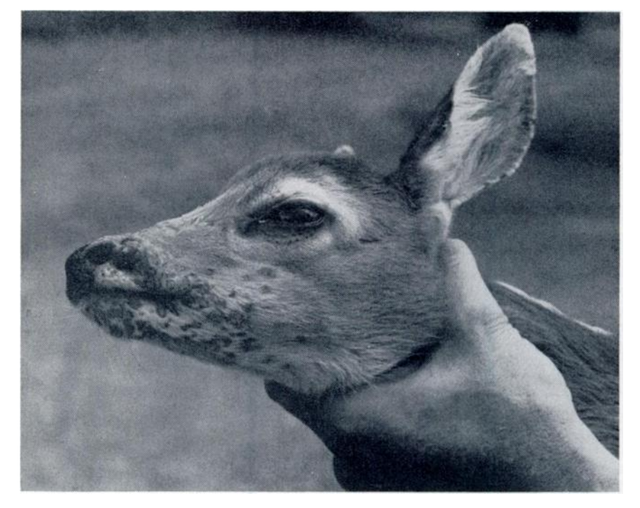
FIGURE 1. White-tailed deer buck fawn with papules of dermatophilosis on the muzzle and ear margin.

In Giemsa-stained 10 \mu m frozen sections from skin lesions, long, parallel chains and individual coccoid cells characteristic of D. congolensis were evident primarily in the stratum corneum, with foci of these organisms frequently associated with hair follicles (Fig. 2). Hyperkeratosis, delamination and erosion of the stratum corneum resulted from local proliferations of these bacteria. The cel-