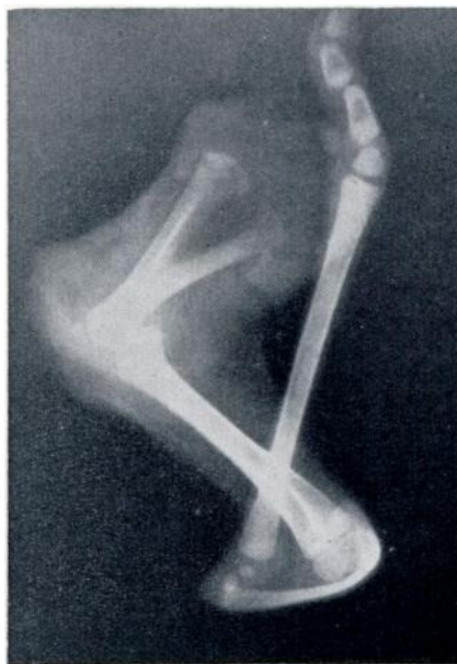
FIGURE 2. Radiograph of left forelimb showing 180° sagittal bowing of the radius and ulna, white-tailed deer fawn.

hypostatic congestion of the left lung there were no grossly observable thoracic lesions. The forestomachs contained only a small volume of watery pale green fluid and the intestines, a small amount of mucus. There was no evidence the animal had suckled. Gross lesions of the brain and spinal cord were not observed. The sectioned right femur was unremarkable.