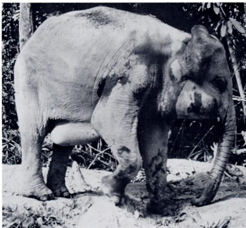
FIGURE 1. Asian elephant showing clinical signs of submandibular and ventral oedema associated with anemia and hypoproteinemia and infection of Fasciola jacksoni .

Sulphobromophthalein (BSP) liver function tests were performed on four elephants including Kala. A polyvinylchloride cannula was introduced into a marginal ear vein of each ear, and