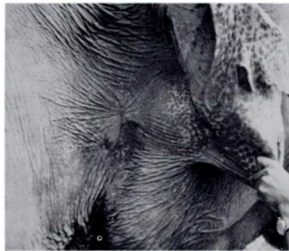
FIGURE 3. Same lesions as in Figure 2 after two months.

stone eggs were present in most fecal samples, the elephants were given thiabendazole □ three months after treatment with nitroxylin because the strongyle egg count was up to 200 eggs per gram in one elephant. Numerous nematodes identified as Murshidia murshidia and Quillonia renneie 12 were passed in the feces the day following treatment with thiabendazole.