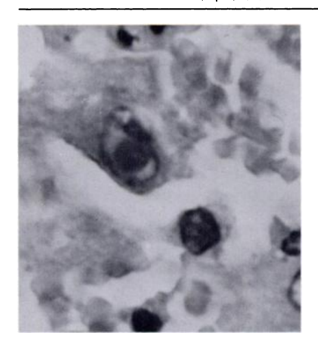
FIGURE 1. A dense intranuclear inclusion body in a hepatic cell from a young raccoon. H & E stain. ×4100.

seen in erythrocytes on a stained blood smear. No pathogenic microorganisms were cultured from internal organs.