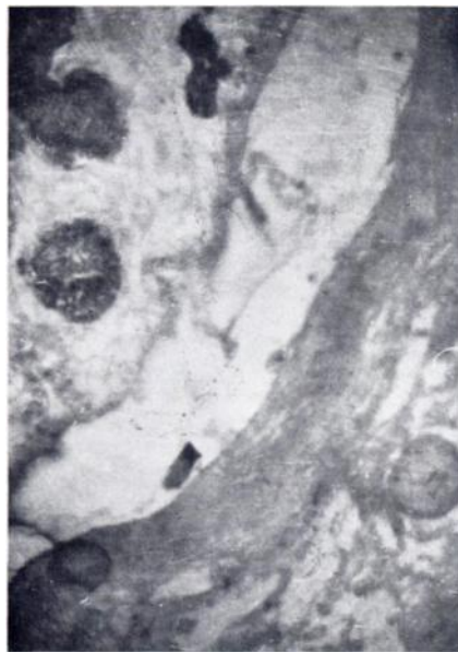
FIGURE 2. Parasitic cyst showing thickened capsule of fibrous tissue around the parasite. H & E. \times 35

Trematode eggs were randomly distributed within the lung parenchyma (Fig. 3). The inner content of some eggs was not visible, only the egg shell being discernible. Alveoli around these eggs were completely consolidated. There was infiltration of mononuclear inflammatory cells and macrophages, resembling a granuloma. Occasionally some eggs released from worms were observed lying in the clear space near the cystic wall. The alveoli in other areas showed atelectasis and blood pigments. Hemorrhage was an occasional feature.