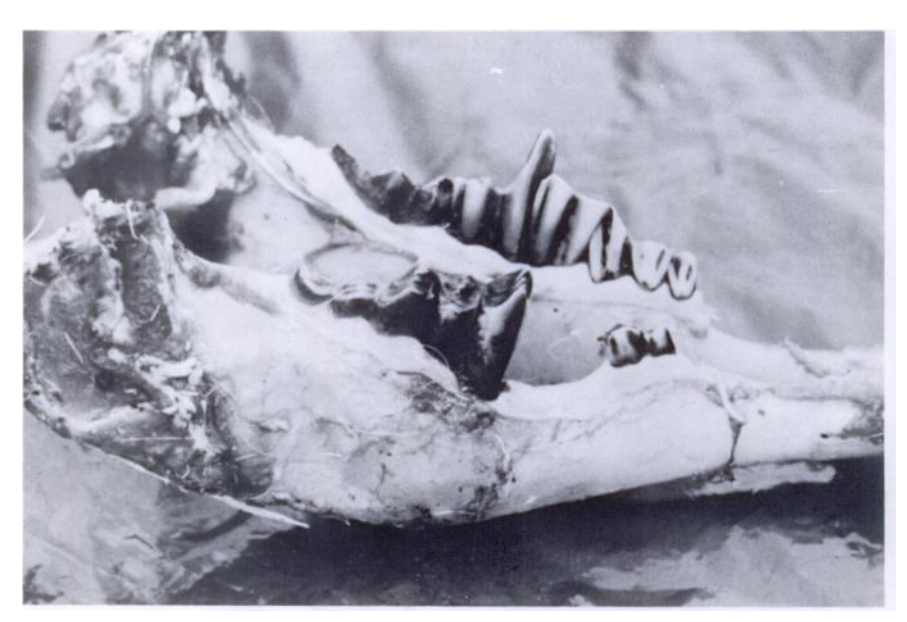
FIGURE 1. Mandibles of a Dall's sheep showing a tooth that is missing or has undergone excessive abrasion resulting in aberrant protrusions of opposing occluding teeth.

Impacted vegetation was observed in some of the mandibles between the gingiva and crown-root junction of molar teeth. The impacted substance, which often consisted of hardened plant material, extended downward along the roots of molar teeth.