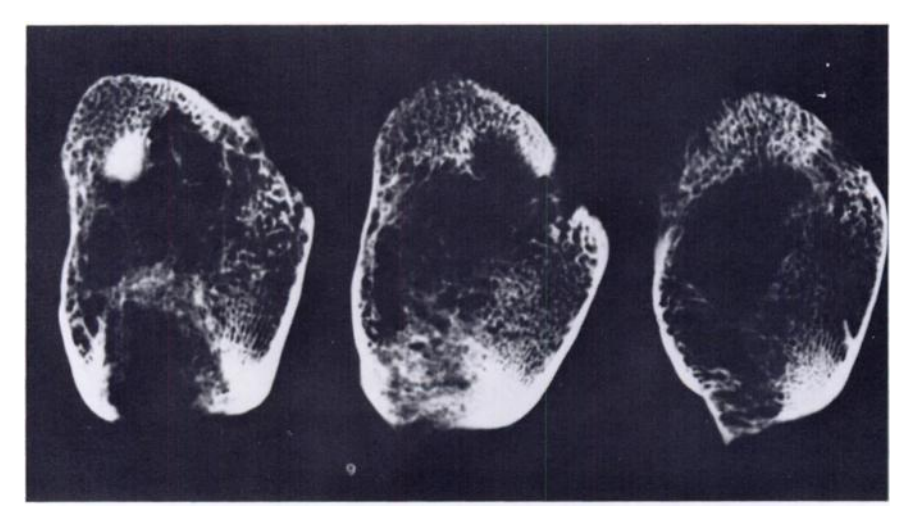
FIGURE 3. Cross sections of affected mandibles showing extensive loss of trabecular and cortical bone.