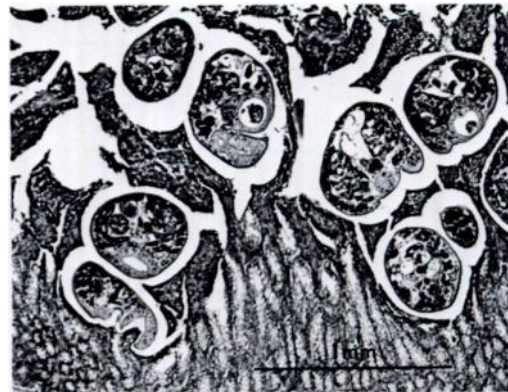
FIGURE 2. Nanophyetus salmincola in the mucosa of the small intestine of infected coyote. H&E stain.

Trematode eggs were not detected in coyote feces on the day of exposure. Numbers of trematodes recovered, occurrence of eggs in feces, and presence of rickettsiae in lymph nodes are summarized in Table 1. Control coyotes did not develop clinical signs of SPD and trematode eggs were not detected in their feces.