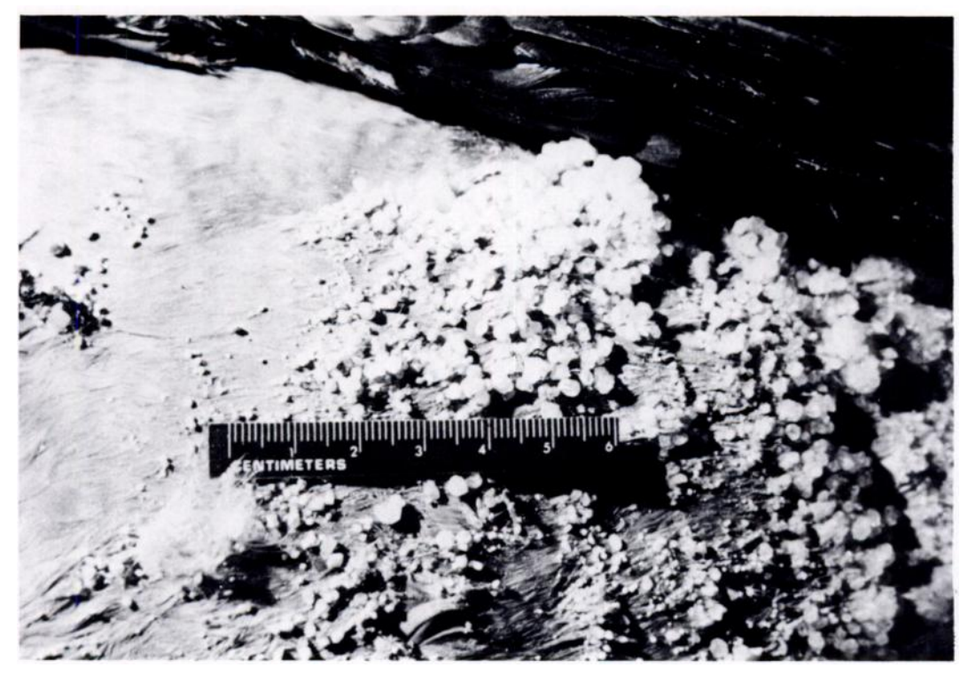
FIGURE 2. Salt accumulation on feathers of Canada goose that died of salt poisoning at White Lake, North Dakota.

and/or released after gaining access to fresh water, and (5) no evidence of other toxic, traumatic or infectious diseases.