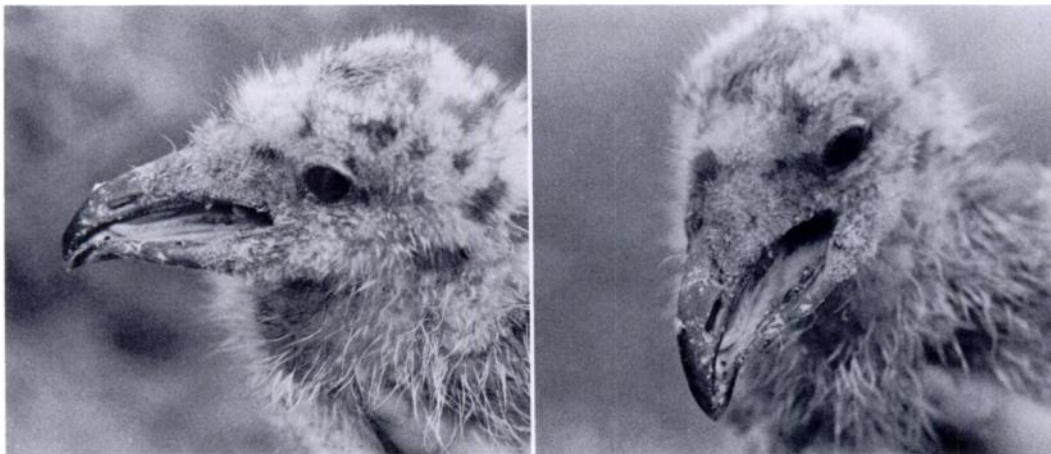
FIGURE 1. Lateral and frontal view of a herring gull chick with a deformed skull.

On 21 July 1983, on the same island, another deformed herring gull, about 25 days of age, was found (Fig. 1). Only the head and bill of the chick were deformed, with the deformities being described herein. Chiasson (1983) was used as the source reference for bone terminology. The bird was banded with a U.S. Fish and Wildlife Service band and appeared to thrive while under parental care. On 9 August 1983, by which date all but a few gull chicks had fledged, the chick was found dead. The chick was extremely emaciated and we suggest that the deformity prevented proper feeding and proved fatal. The chick was photographed