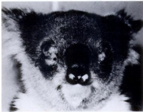
FIGURE 3. An example of keratoconjunctivitis in a koala.

et al., 1977). These point estimates are reported along with lower and upper bounds of the 95% confidence interval (Fleiss, 1981). Additionally, six other koalas had mild degrees of corneal scarring characterized by centralized, circular opaque regions which did not seem to interfere with vision. The conjunctival tissues from only one of these six koalas yielded C. psittaci .