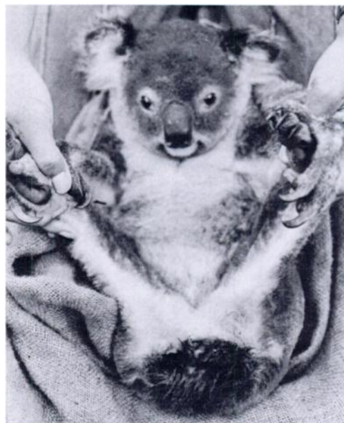
FIGURE 2. An example of “dirty tail” in a koala.

The comparisons between these cases and the isolation of C. psittaci in tissue culture are shown in Table 2. The sensitivity and specificity of diagnosing infected koalas by clinical signs of disease in this study were determined to be 13% (5, 25) and 100% (76, 100), respectively (Schwabe