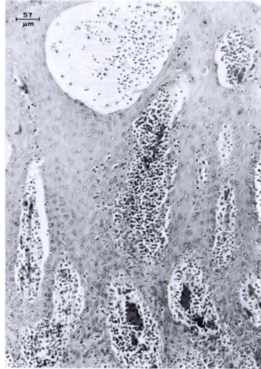
FIGURE 3. Perivascular infiltrates of the superficial lamina propria of the palatine mucosa of a white-tailed deer with malignant catarrhal fever. Lymphocytic infiltrates extend into the contiguous lamina epithelialis and are accompanied by epithelial degenerative changes and vesicle formation.

The inflammatory cell population contained smaller numbers of macrophages and occasional neutrophils in addition to the predominantly LC-LB populations. Infiltrates into deeper tissues and overlying epithelium, predominantly the stratum basale, were present. The latter was associated with widespread ballooning degeneration and necrosis, progressing to vesicle formation, of cells in the overlying stratum granulosum. Vesicles contained proteinaceous fluid, necrotic and degenerative cellular debris, and mixed inflammatory cell infiltrates. They were occasionally associated with full thickness epithelial necrosis and ulceration. Moderate widespread cellular infiltrates, edema, and vasculitis of the abomasal lamina propria mucosa, submucosa and subjacent tunica