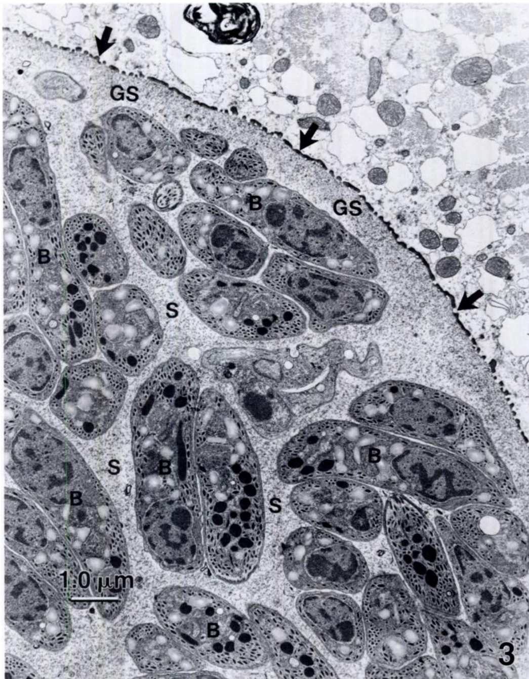
FIGURE 3. Transmission electron micrograph of a sarcocyst in an experimentally infected prairie vole. Note the ornamented primary cyst wall (arrows), ground substance (GS), bradyzoites (B), and septa (S). Uranyl acetate and lead citrate. Bar = 1 \mu m.