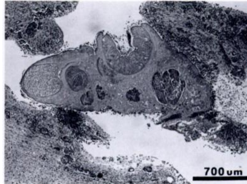
FIGURE 2. Section through a cavitated area of a striped dolphin brain containing a Nasitrema sp. trematode. The surrounding neuropil is hypercellular due to infiltrates of macrophages and lymphocytes, and increased numbers of glial cells. H&E.

lom (Fig. 2). Most internal structures were indistinct (because of necrosis) and much of the tegument was covered by macrophages and multinucleated giant cells. There were also numerous oval or triangular eggs (60 to 80 \mu\text{m} the long axis) with an approximately 6 to 8 \mu\text{m} wide refractile, slightly birefringent golden brown wall (Fig. 3). A single operculum was sometimes identified. Most eggs were fractured and/or distorted and many were partially encompassed by multinucleated giant cells. Capillaries within the lesion were hyperplastic and had degenerate (basophilic) walls. Scarred areas of brain contained proliferations of fibrous astrocytes. The surrounding parenchyma contained numerous vacuoles, increased numbers of glial cells, and scattered swollen axons.