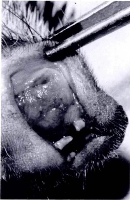
FIGURE 2. Oronasal squamous cell carcinoma protruding into the oral cavity from the maxilla and hard palate of a hedgehog.

tissue. These cells had abundant eosinophilic cytoplasm which, in many cells, was partially keratinized. Nuclei were round to oval and vesicular with one or two prominent nucleoli. Mitoses were infrequent (Fig. 4). Retropharyngeal lymph nodes were infiltrated by neutrophils (suppurative lymphadenitis), but there was no metastatic carcinoma. Additional findings were bilateral adrenal cortical hyperplasia and splenic extramedullary hematopoiesis.