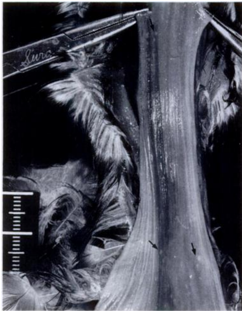
FIGURE 3. Esophagus of a mallard. Many tiny, raised, white foci are present in the mucosa (arrows). The microscopic appearance of these is shown in Figure 4. (Bar = 2 cm.)

was made along the river and scavengers were active at the site, so the birds found dead represented an unknown proportion of those that died.