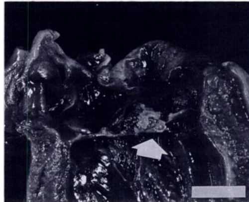
FIGURE 2. Opened left ventricle of the heart from a mallard. There are vegetative growths on the atrio-ventricular valves (arrow). Staphylococcus aureus was isolated from this material. (Bar = 1 cm.)

Staphylococcus aureus was isolated from liver of the birds with endocarditis but not from liver of the other four intact birds collected on 8 February. Staphylococcus aureus also was isolated from spleen and kidneys of birds with endocarditis, and from lung and heart valves of one bird. Other bacteria, including Serratia sp., Lactobacillus sp., Yersinia enterocolitica , Vibrio fluvialis , and gamma Streptococcus sp., isolated in small numbers from liver of birds collected 8 February (both those with endocarditis and those without), were considered to be contaminants. Staphylococcus aureus was isolated in pure culture from the bone marrow of a male collected 13 March. Only the head, neck, skeleton and wings were available for examination from this bird.