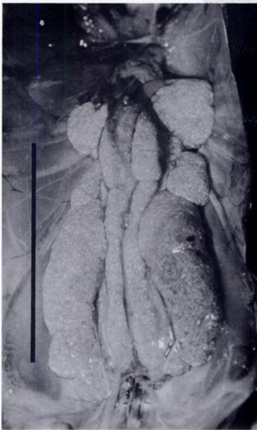
FIGURE 1. Renal coccidiosis ( Eimeria truncata ) in a greylag ( Anser anser anser ) gosling. The kidneys are greatly enlarged and pale. The bird is emaciated. Bar = 10 cm.