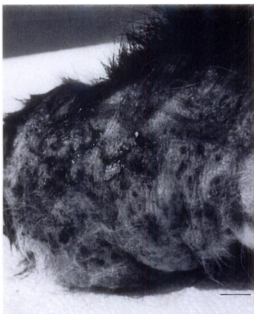
FIGURE 1. Photograph of alopecic area of skin on the dorsal aspect of the head of a striped skunk infected with Filaria taxideae showing the multifocal hemorrhagic crusts resulting from filarial dermatitis. Bar = 1.4 cm.

heart, lung, liver, spleen, kidney, stomach, intestine, pancreas, and brain were fixed in neutral buffered 10% formalin, embedded in paraffin, sectioned at 5 \mu m, and stained with hematoxylin and eosin (H&E) for histologic examination. Aseptically collected swabs of cutaneous abscesses were submitted to the Athens Diagnostic Laboratory (Athens, Georgia, USA) for aerobic bacterial culture according to standard bacteriologic techniques (Ikram and Hill, 1991). Briefly, swabs were streaked onto 5% sheep blood agar plates directly and after overnight enrichment in thioglycolate broth at 37 C. Inoculated plates were incubated at 37 C, and bacterial colonies identified visually and via testing with an o-nitrophenyl- \beta -d-galactopyranoside disc (Becton Dickinson & Co., Rutherford, New Jersey, USA). Sections of the cerebrum including hippocampus were submitted to the same laboratory for fluorescent antibody testing for rabies virus (Veleca and Forrester, 1981).