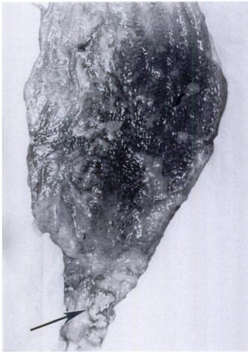
FIGURE 1. Gastric mucosa of a frilled lizard from Australia showing a dark color, prominent rugae and excessive amounts of mucus. Note also the firm yellow-white material on the pyloric mucosa (arrow).

necropsy, it was judged to be in very poor nutritional condition due to paucity of adipose tissue and generalized muscle atrophy. The spleen was enlarged and friable. The liver also was friable, with a locally extensive pale area over one half of the dorsal hepatic surface. The stomach was firm with mild thickening of the gastric mucosa. Gastric rugae were prominent and the mucosa was red with a thin layer of dark red mucus on its surface (Fig. 1). In addition, a 6 mm diameter area of firm yellow-white material was observed on the mucosa of the pyloric region. The intestinal tract was empty and no macroscopic parasites were observed. The lungs showed diffuse reddening. No gross lesions were visible in other major organs.