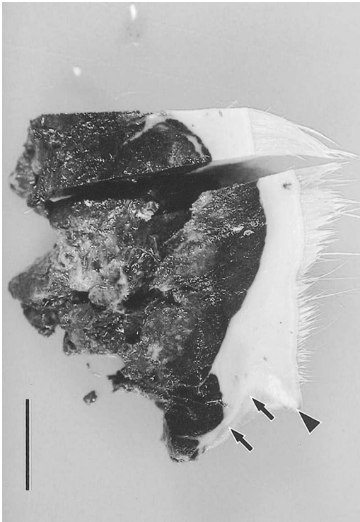
FIGURE 1. Marginal part of eyelid with tumor. Formalin-fixed sample. The tumor mass was black and firm. The tumor protruded to the palpebral conjunctiva (arrows) and ruptured. The palpebral skin and meibomian glands (arrowhead) were intact. Bar = 1 cm.