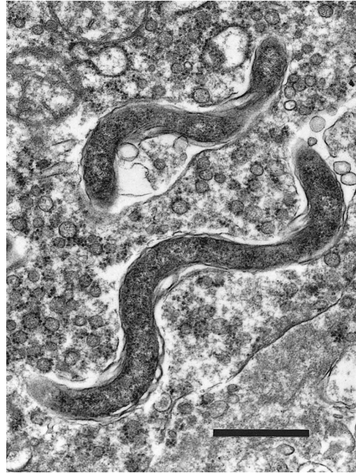
FIGURE 3. Transmission electron micrograph of two spirochetes in the space of Disse in the northern spotted owl's liver. Bar = 1 \mu\text{m} .

When a modified Steiner's silver stain for spirochetes (Garvey et al., 1985) was applied to tissue sections numerous long, thin, spiral bacteria were visible in blood vessels throughout the body (Fig. 2) and were accumulated in the cerebral lateral and third ventricles. Spirochetes were lying in tangles in the hepatic sinusoids and were scattered throughout the splenic parenchyma. Spirochetes were occasionally present in renal tubules but were infrequent there in comparison with the renal glomerular and interstitial blood vessels. For comparison, liver sections from 13 northern spotted owls that died in Kittitas County (Washington, USA) ( n = 6 ) or