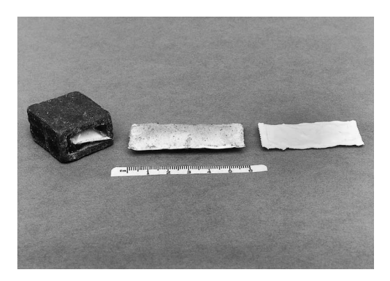
FIGURE 1. Fish meal polymer bait on left (2.0 \times 3.5 \times 3.5 \text{ cm}, 26 \text{ g}) ; sachet bait in center (0.5 \times 2.0 \times 6.0 \text{ cm}, \sim 3.8 \text{ g}) ; and right, typical sachet masticated, emptied of vaccine, and discarded by a raccoon.

polyethylene heat-sealed vaccine sachets with approximately 2 ml of either vaccine media (placebo) or Raboral V-RG® vaccine, depending upon objectives of the trials. Use of vaccine media-filled baits greatly facilitated ability to conduct field trials because meeting regulatory requirements could be avoided. When objectives called for the use of vaccine, Merial inserted vaccine-laden sachets into polymer baits and secured them into the bait cavity with a melted wax sealant. When the protocol called for vaccine media to be used, media-laden sachets were inserted and sealed into polymer baits and candidate attractants then surfacecoated onto the polymer baits at SCWDS. The same type sachet was used for both polymer and flavor-coated sachet baits.