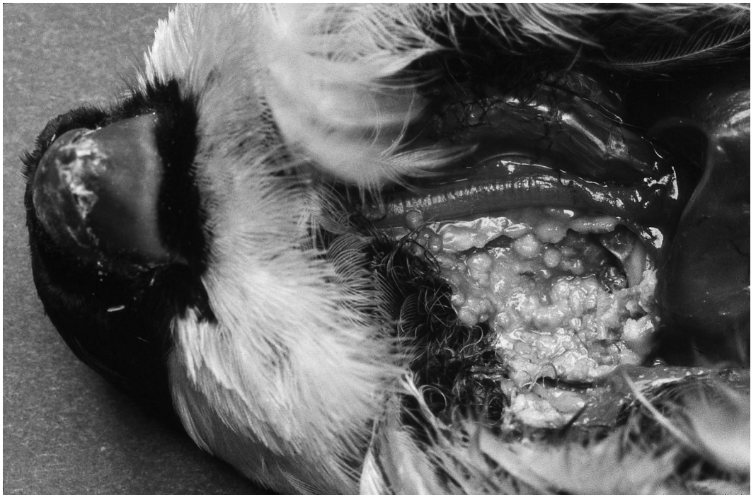
FIGURE 1. Bullfinch ( Pyrrhula pyrrhula ) with extensive and confluent necrosis in the crop wall protruding into the lumen.

Our study supports earlier findings that finches, like bullfinch, Eurasian siskin, common redpoll, and greenfinch, are particularly susceptible to S. Typhimurium infection (Englert et al., 1967; Schaal and Ernst, 1967; Borg, 1985; Routh and Sleeman, 1995; Daoust et al., 2000). Reports of disease in common redpolls are restricted to the Scandinavian peninsula (Borg, 1985) and North America (Daoust et al., 2000), probably reflecting the circumpolar